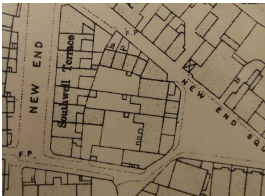
Figure 3: 1893-5 OS map