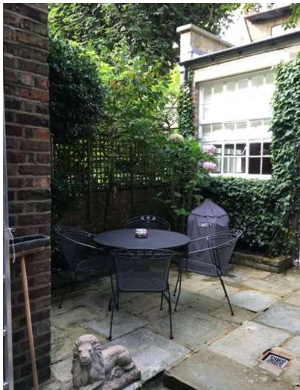
Figure 15: Site of proposed link showing studio window