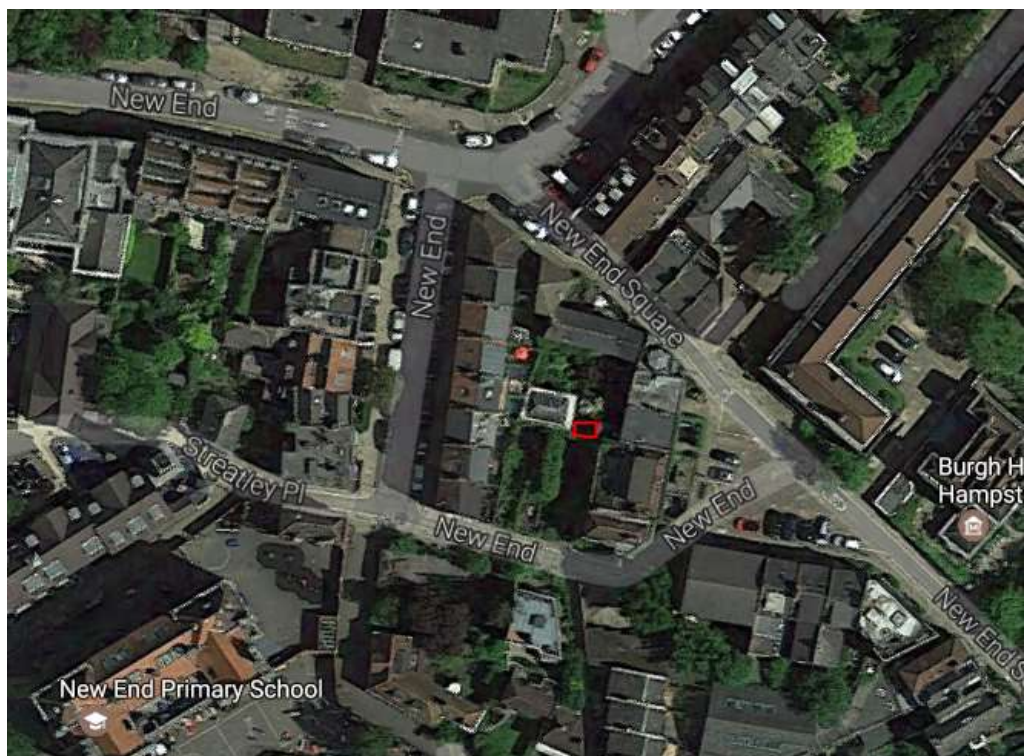
Figure 17: Aerial image showing, edged in red, the position of the proposed link structure

4.15 The site of the proposed link structure is part of a private garden that is not visible from public vantage points. The character and appearance of the garden and its contribution to the area has changed over time, most significantly between c.1915 and 1927 when the original rear outshoot was demolished and rebuilt in a new position and the studio was built. The former openness of the garden was reduced by these works but those alterations had little or no effect on what is now valued as the special interest of the area.