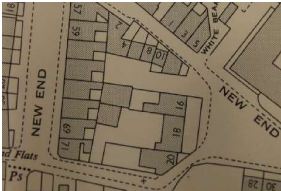
Figure 10: 1953 OS map

shows 14 New End Square to have been demolished following its destruction in the War and the 1965.