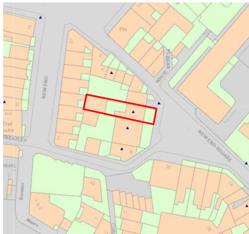
Figure 11: Site location showing listed buildings

Terraced house. C18, refaced in C19, top storey added C20. Multi-coloured stock brick, patched. 3 storeys 1 window. Gauged red brick round arch with impost bands to entrance with radial fanlight and panelled door. Ground and 1st floor sashes with gauged red brick flat arches and flush framed sashes having exposed boxing. 2nd floor has tripartite flush framed sash; plain brick band at window head level. Parapet. INTERIOR: not inspected.