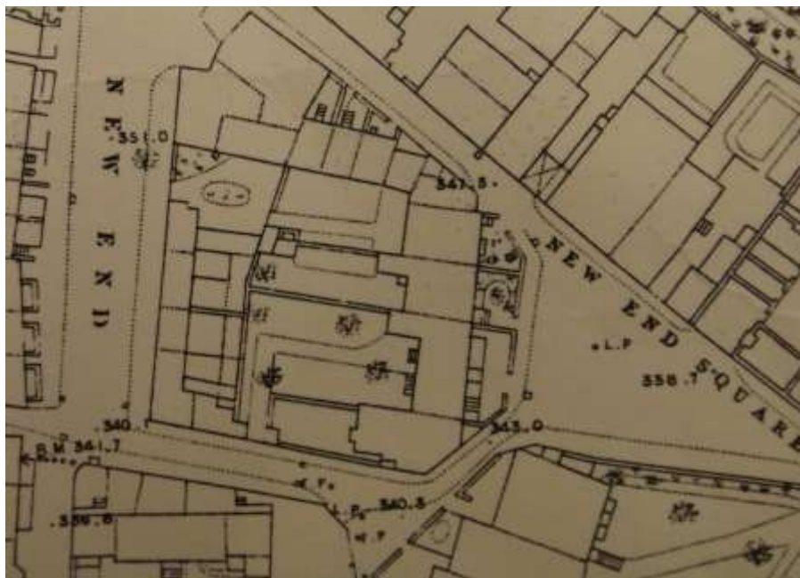
Figure 2: 1866 OS map

end of the garden. 4 It is similarly depicted on OS maps revised in 1893-4, save for a small detached outbuilding offset from the northern outshoot (see Figure 3 ).