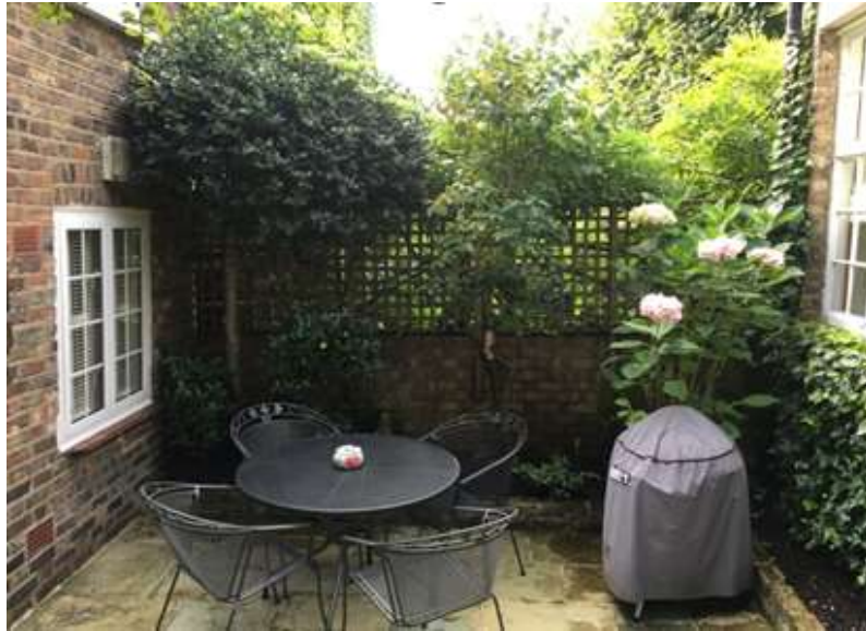
Figure 14: Modern party garden wall where proposed link would be sited