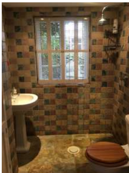
Figure 16: Modern finishes with ground floor of post c.1915 outshoot