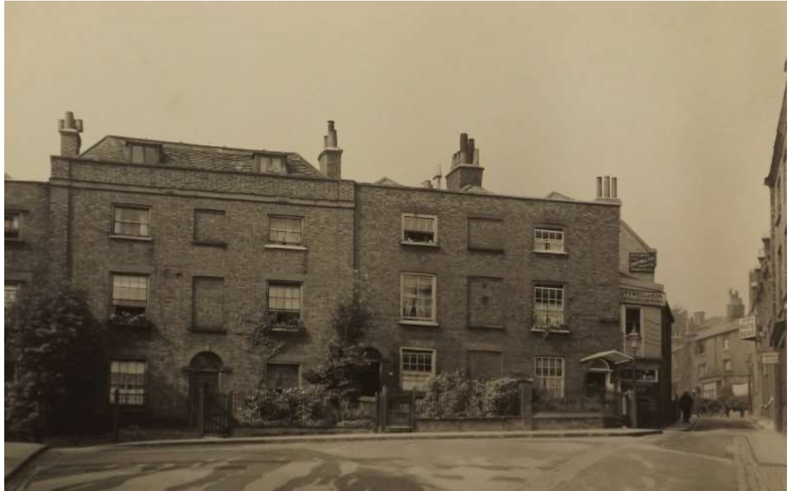
Figure 4: 1910 photograph of the frontage