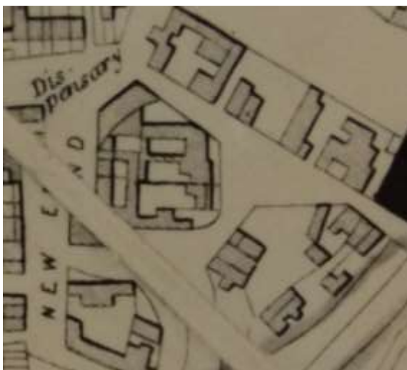
Figure 1: 1864. Daw's map of Hampstead

2.3 Daw's 1864 map of Hampstead suggests that at this time 16 New End Square occupied a rectangular plot and had a stepped rear (west) façade ( Figure 1 ). The map shows a narrow structure at the west end of the garden, and (potentially belonging to either no. 16 or the property to its north) a structure along the north boundary of the garden. 3