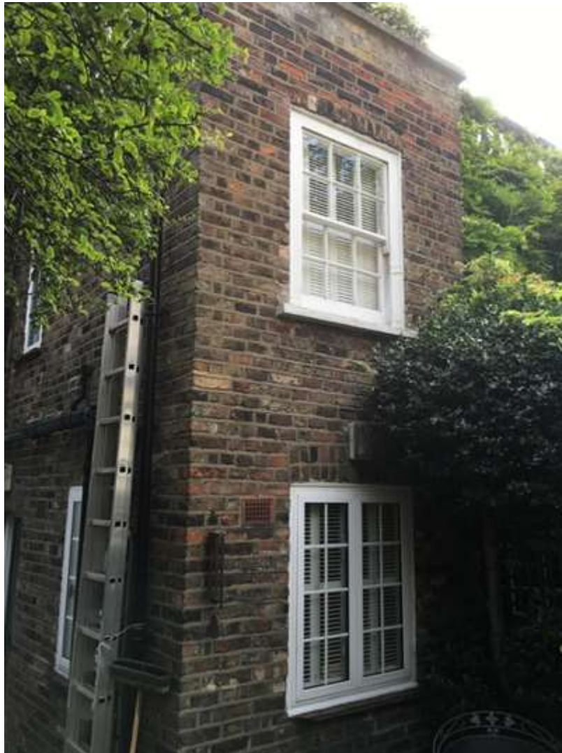
Figure 13: Post c.1915 rear outshoot