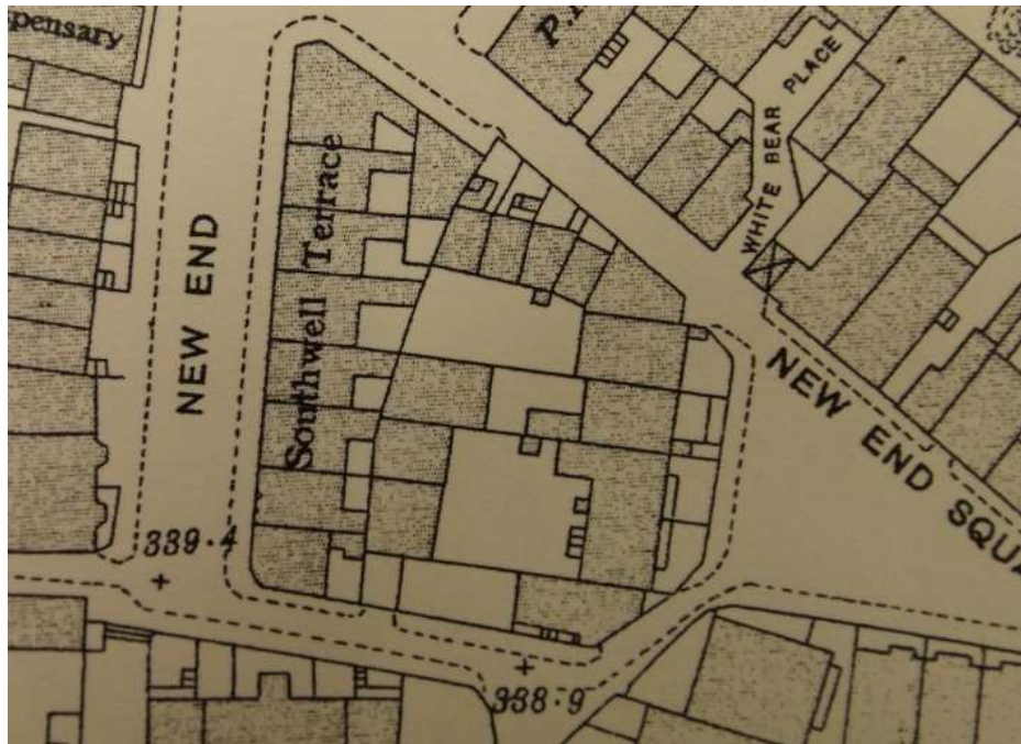
Figure 7: 1935 OS map