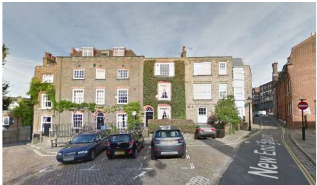
Figure 5: Frontage today