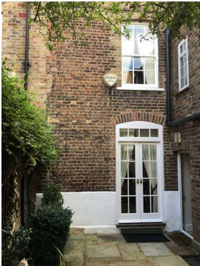
Figure 12: Original part of rear elevation