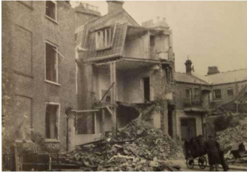
Figure 8: Undated photo showing extent of WWII damage (16 New End Square on extreme left of image)