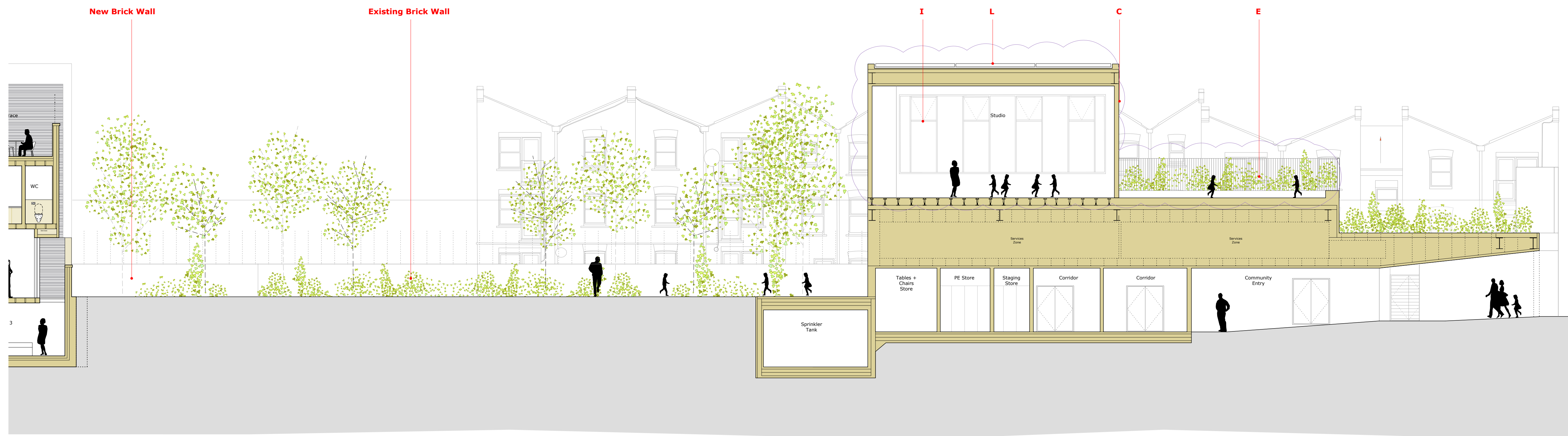
Section 9 1:100