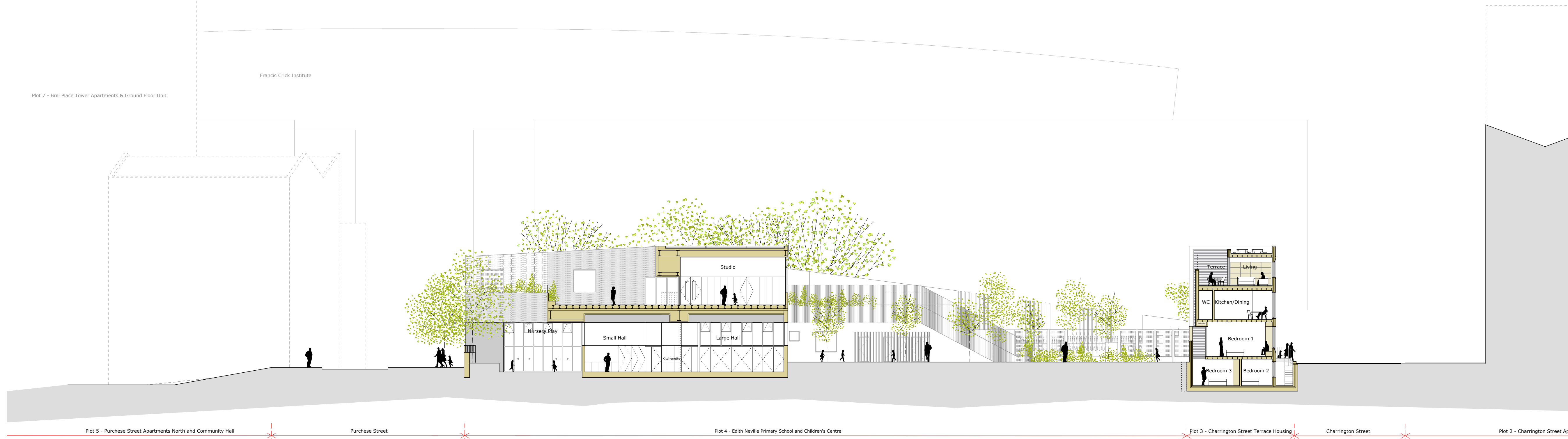
Section 6 in Context 1:200