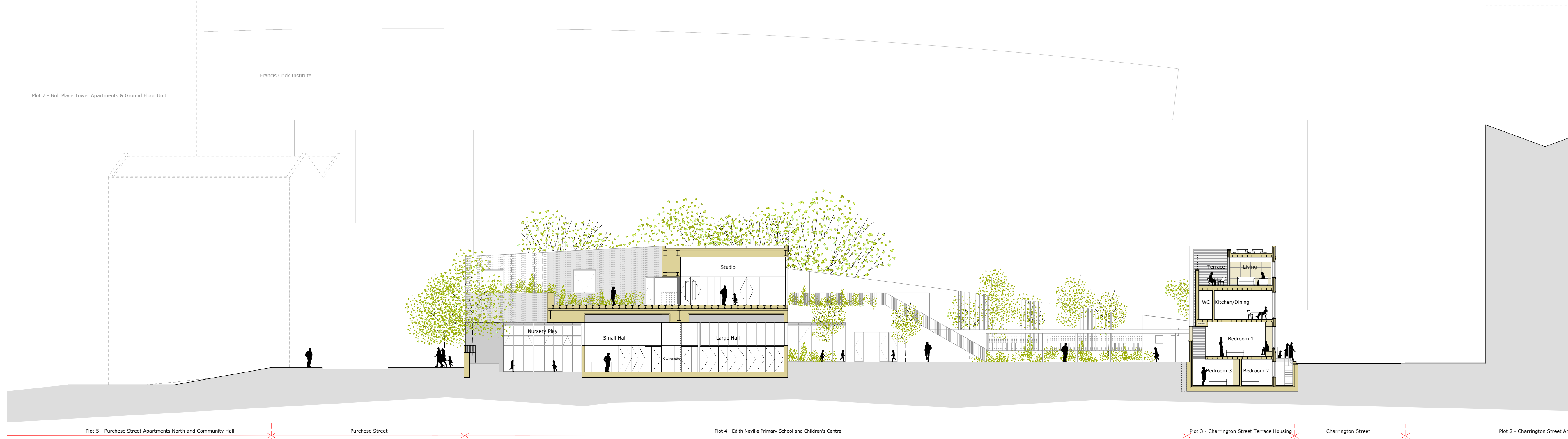
Section 6 in Context 1:200