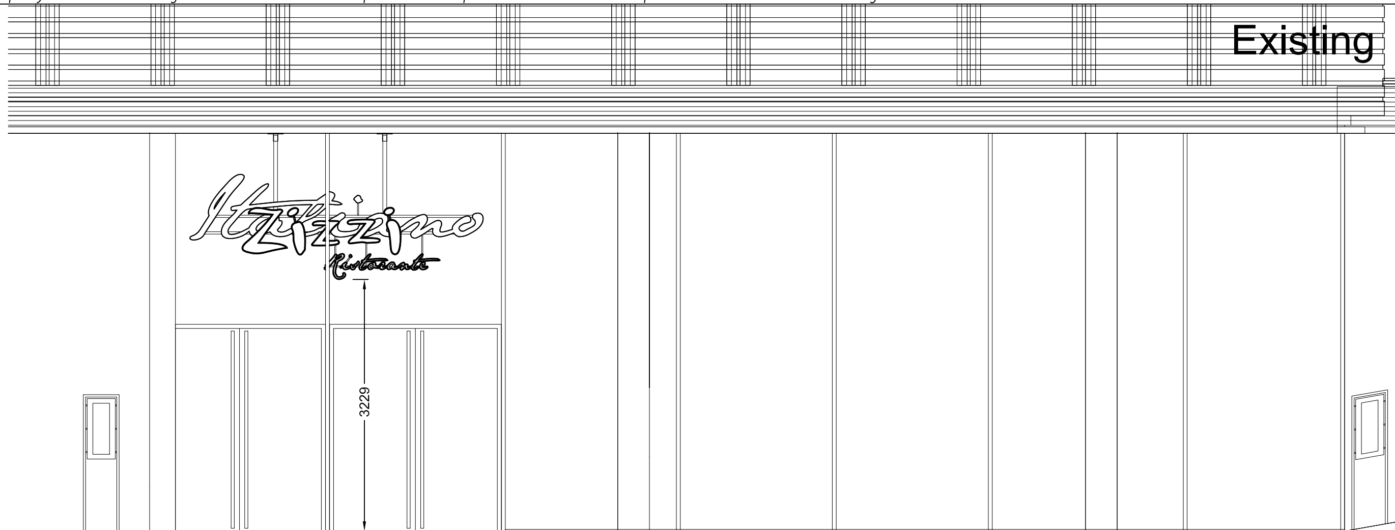
Front Elevation Scale 1:50