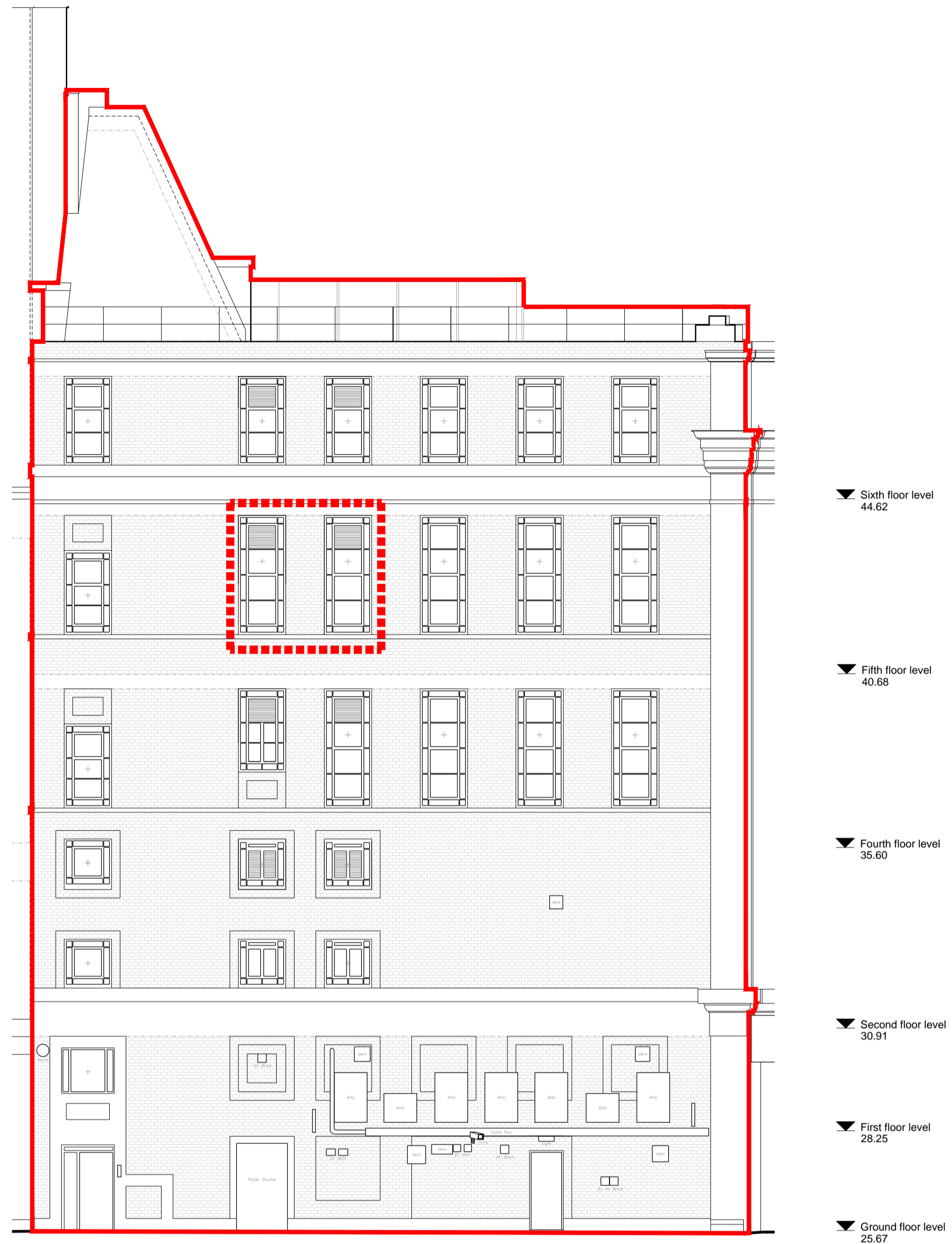
A ELEVATION PROPOSED GA(00)020 1:100@A1