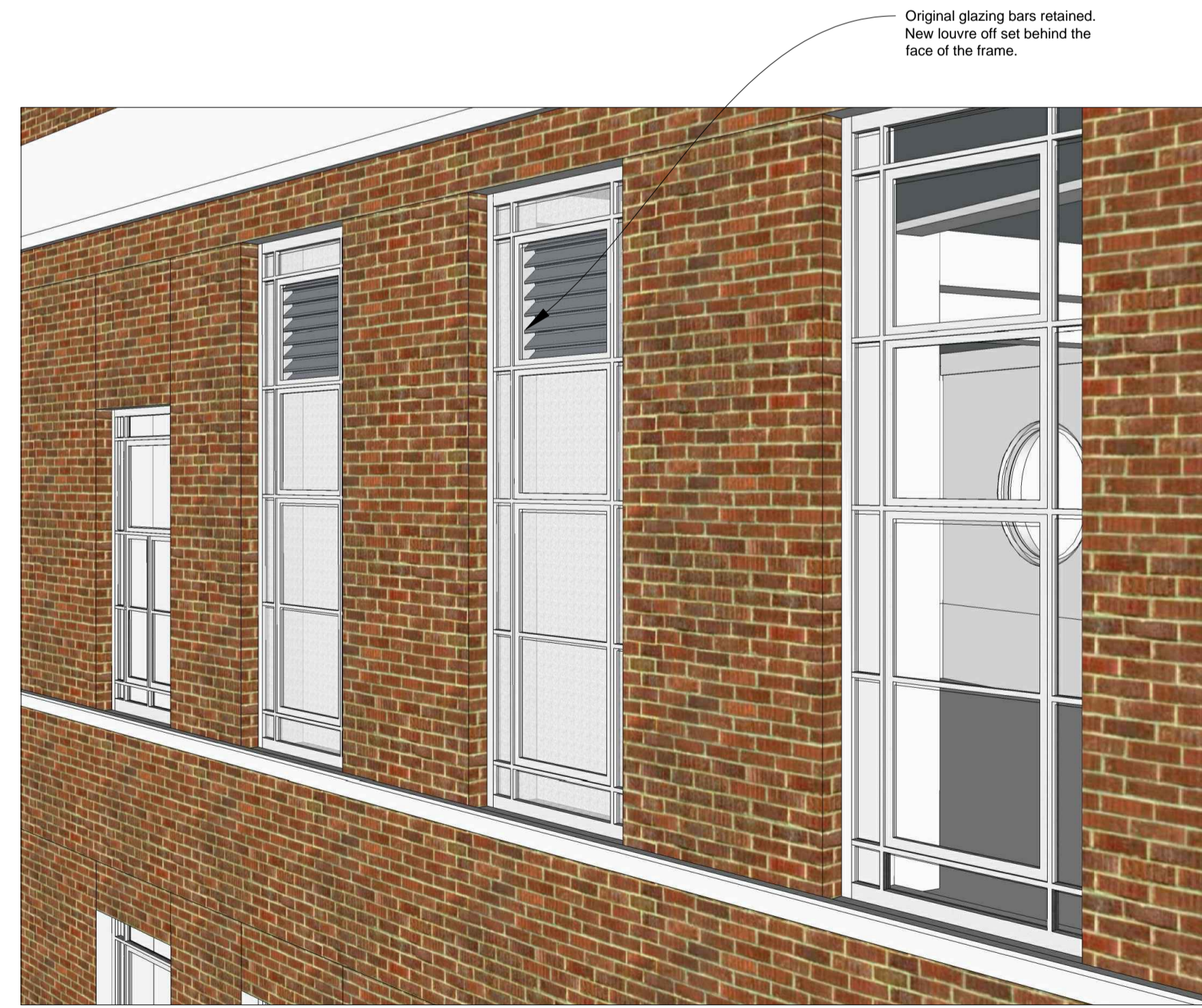
C WINDOW LOUVRE VISUAL GA(00)020