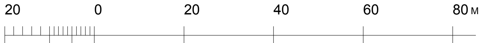
BLOCK PLAN 1:500 @ A3

© Crown copyright and database rights 2017 OS 100035409