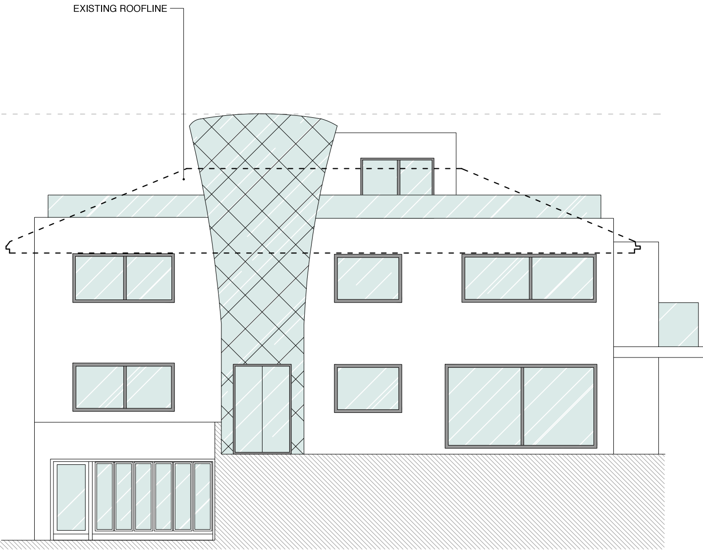
PREVIOUSLY APPROVED DESIGN - FRONT ELEVATION SCALE 1:100