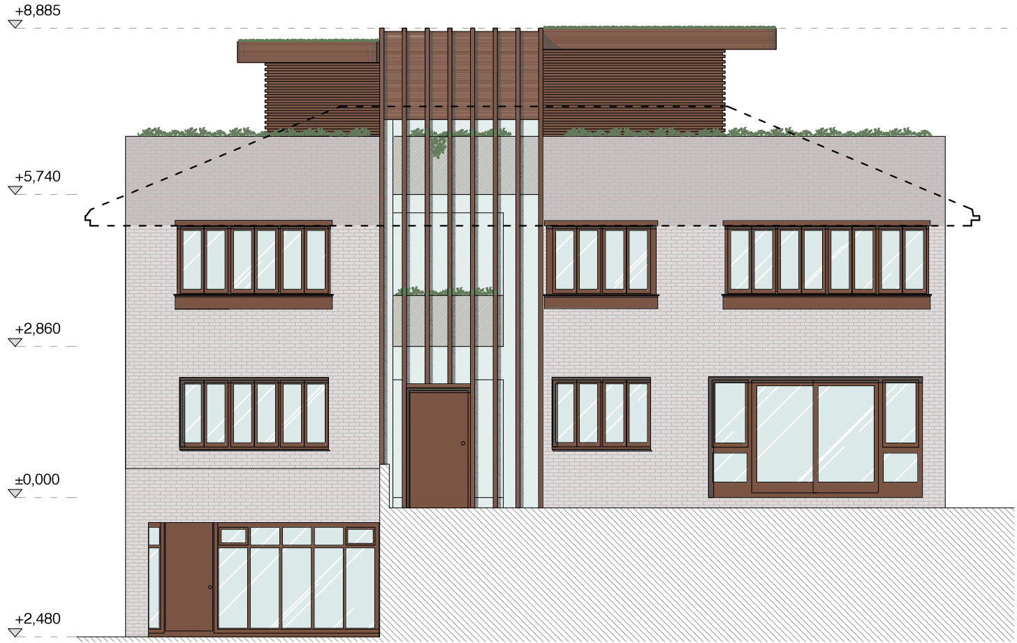
NEW PROPOSED DESIGN - FRONT ELEVATION SCALE 1:100