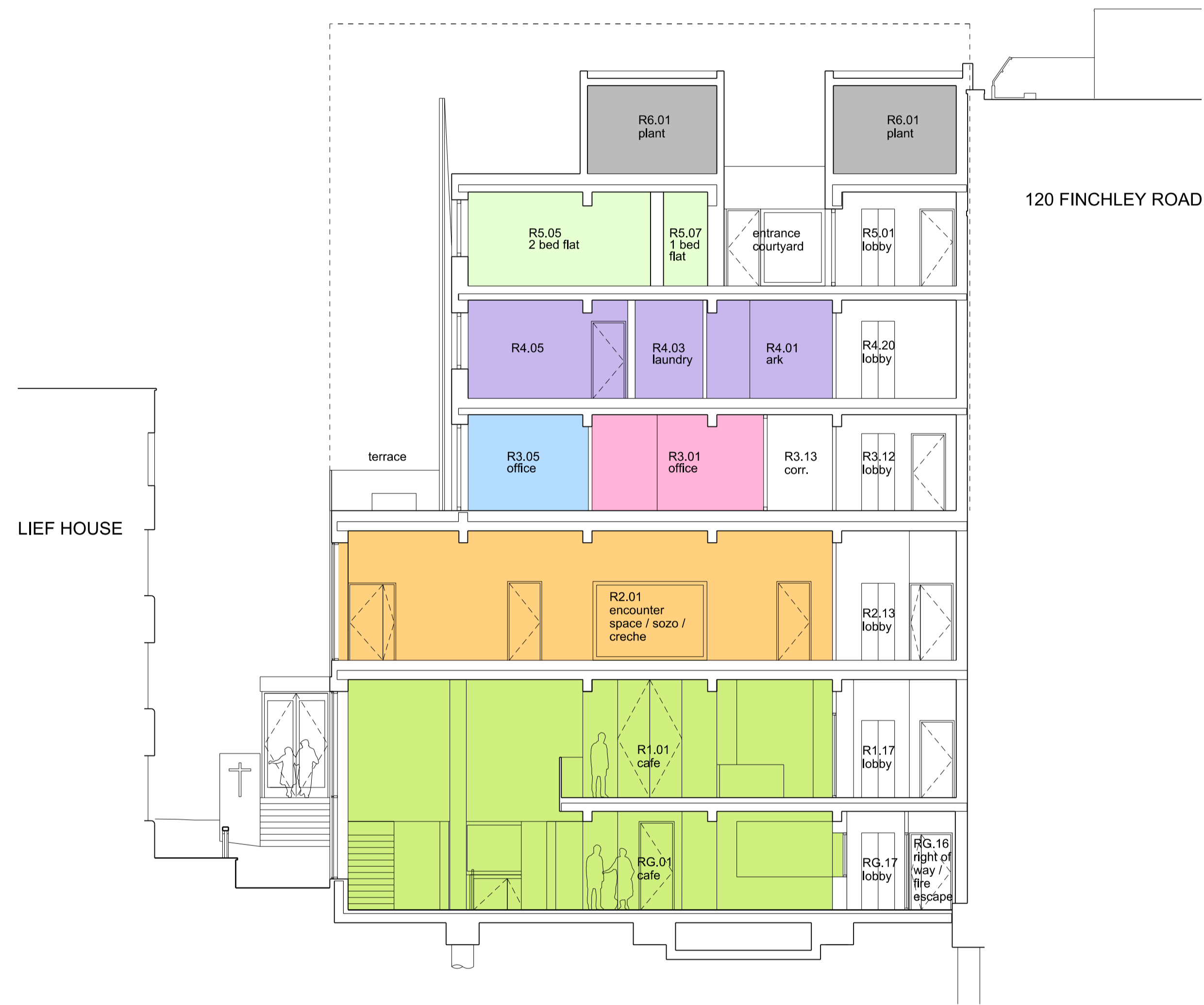
PROPOSED SHORT SECTION THROUGH CAFE

TO BE READ IN CONJUNCTION WITH GA PLANS, SECTIONS AND ELEVATIONS.