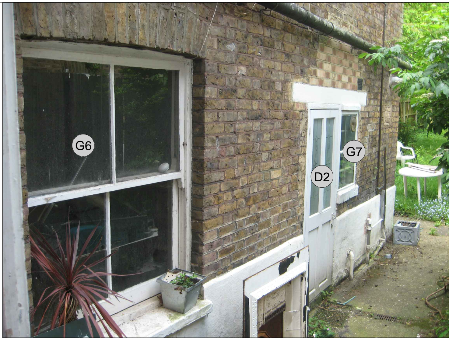
REAR SIDE ELEVATION