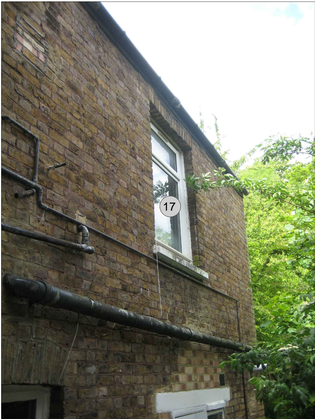
REAR SIDE ELEVATION