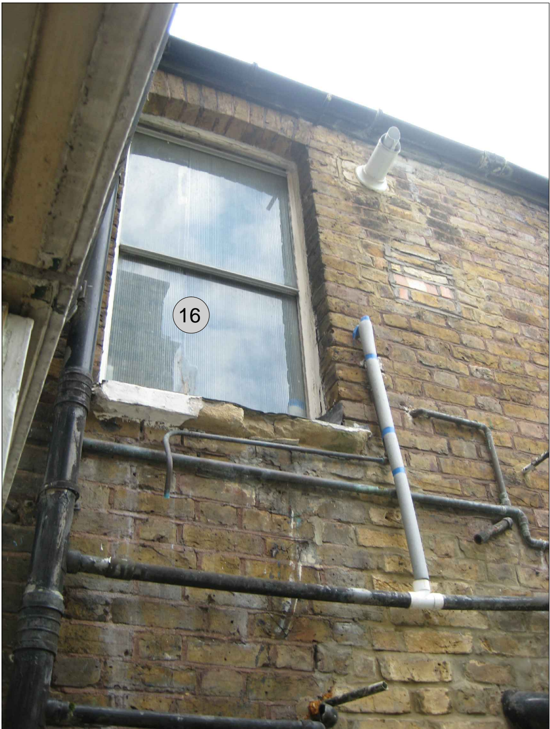
REAR SIDE ELEVATION