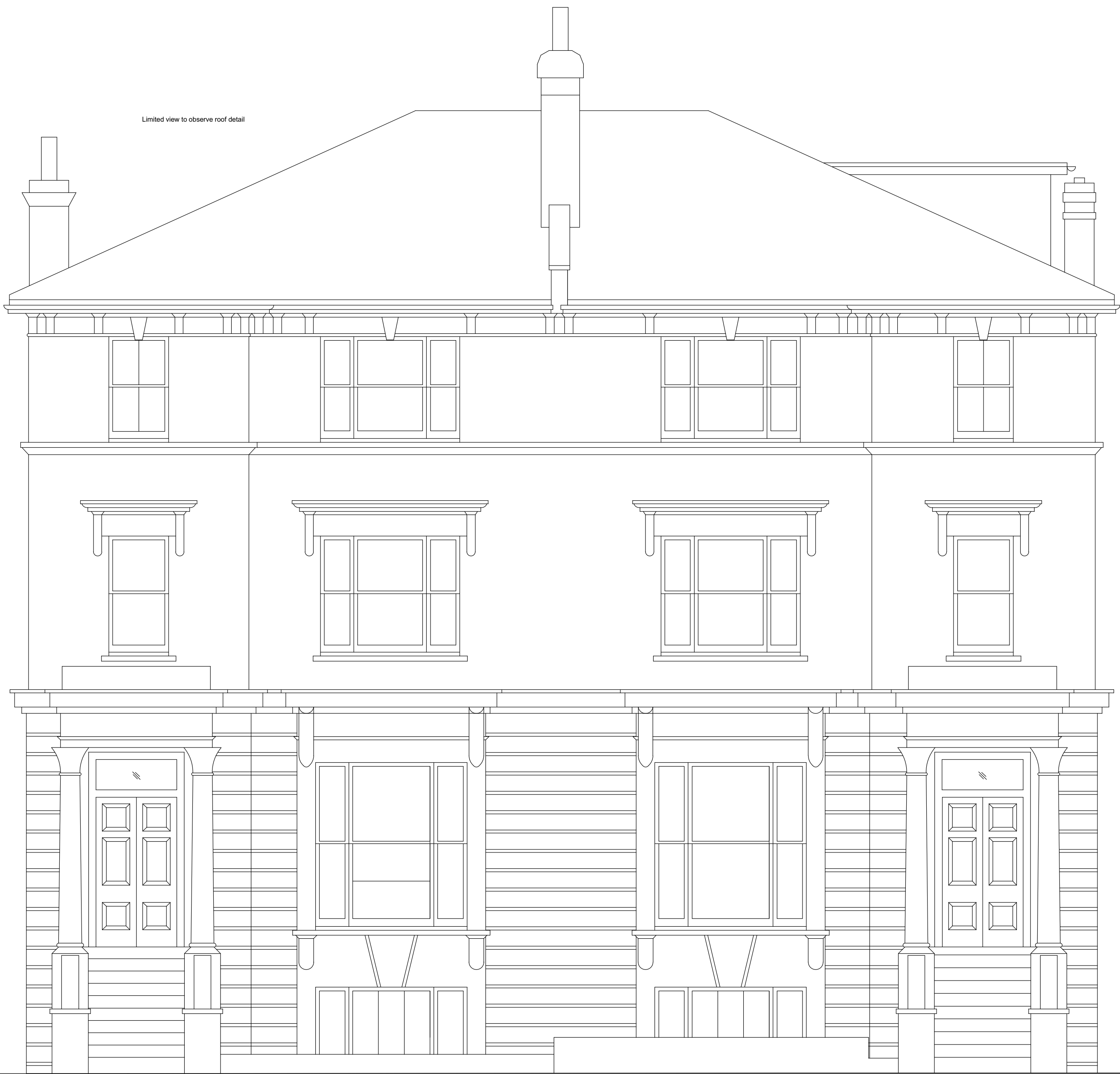
SIDE ELEVATION-PRIORY ROAD