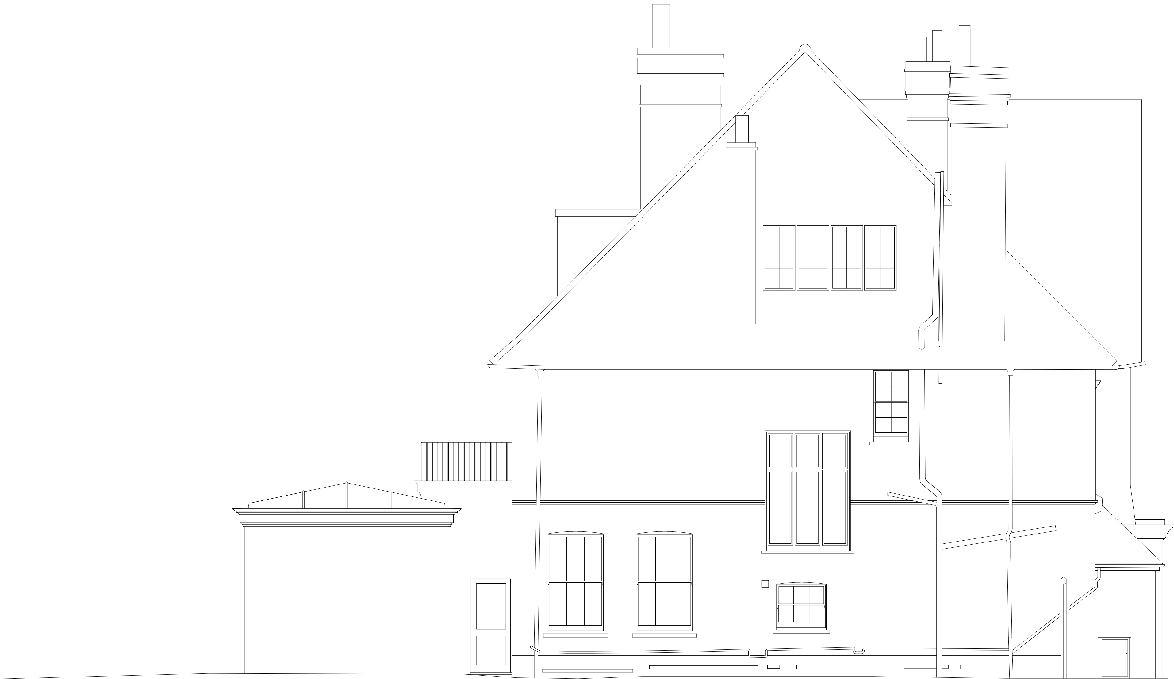
Side Elevation 1:50