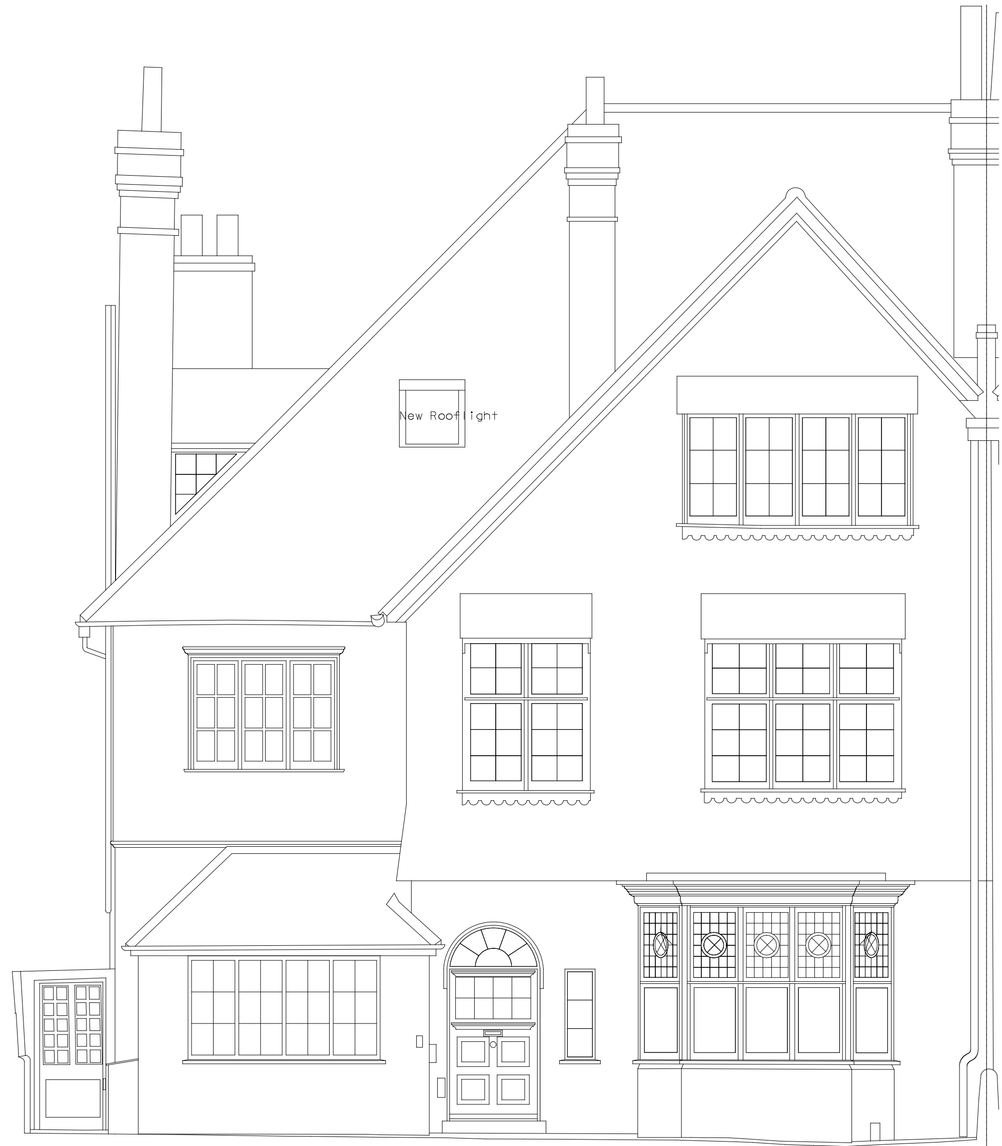
Front Elevation 1:50