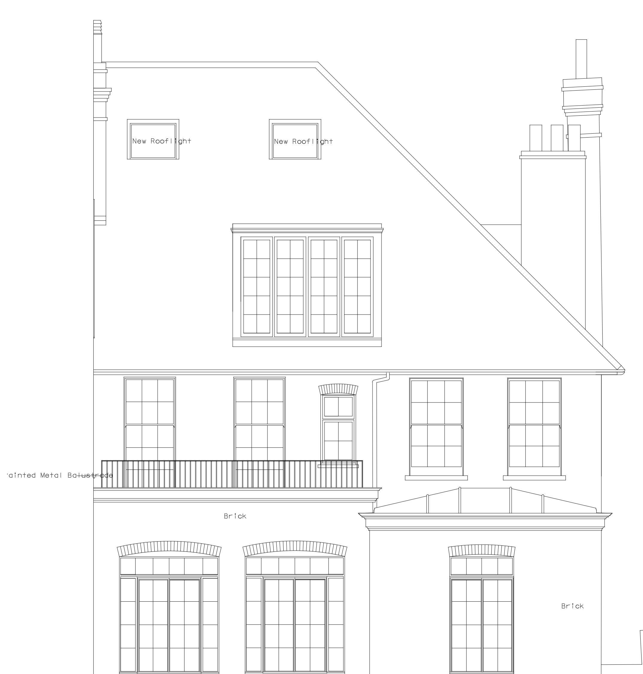
Rear Elevation 1:50