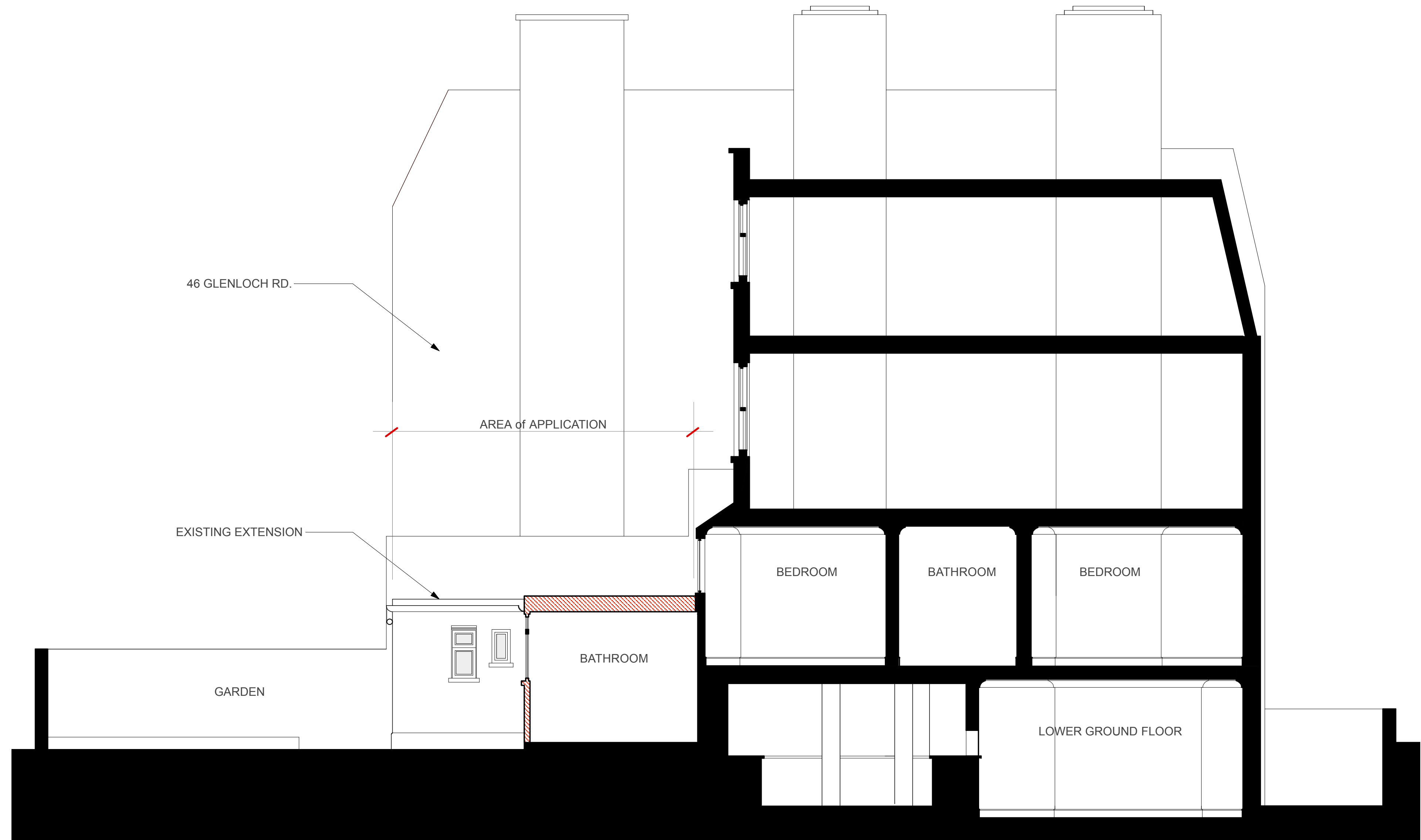
B EXISTNG SECTION B-B