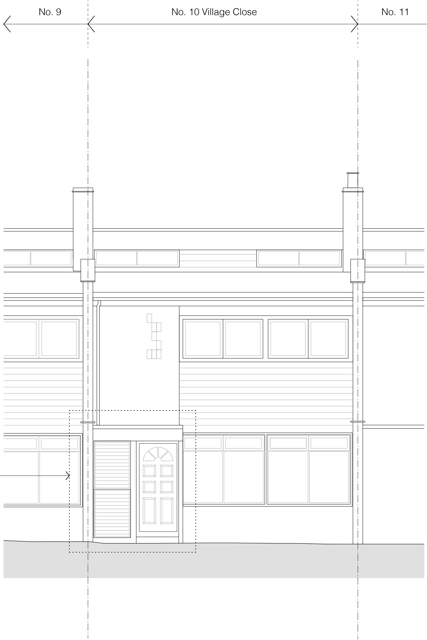
FRONT ELEVATION: PROPOSED