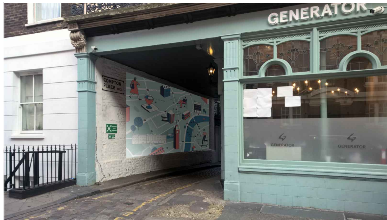
03 Proposed External Wall Mural - Photo 1