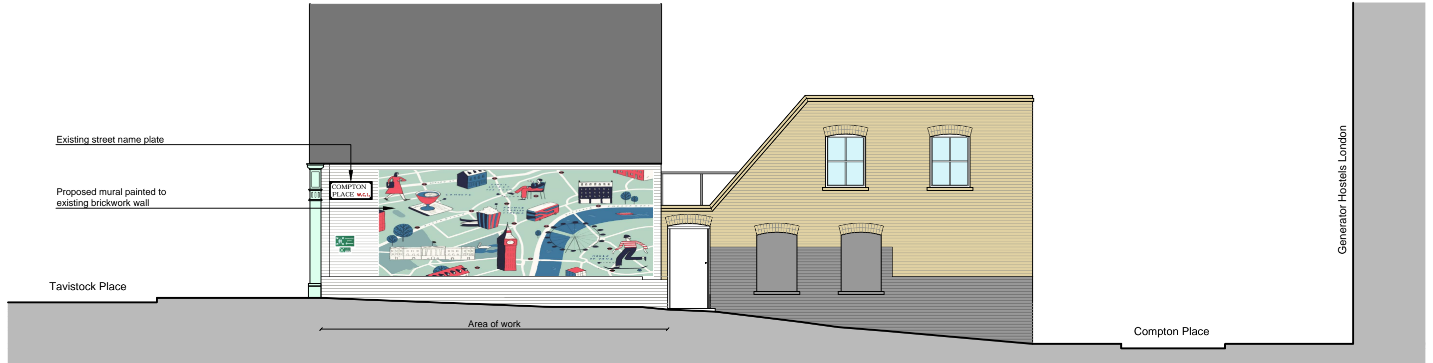
01 Proposed External Wall Mural - Elevation Scale 1:100