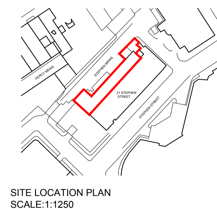
SITE LOCATION PLAN SCALE:1:1250