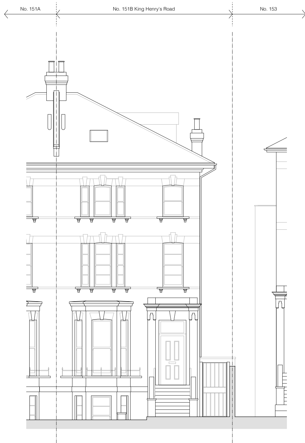
FRONT ELEVATION: EXISTING