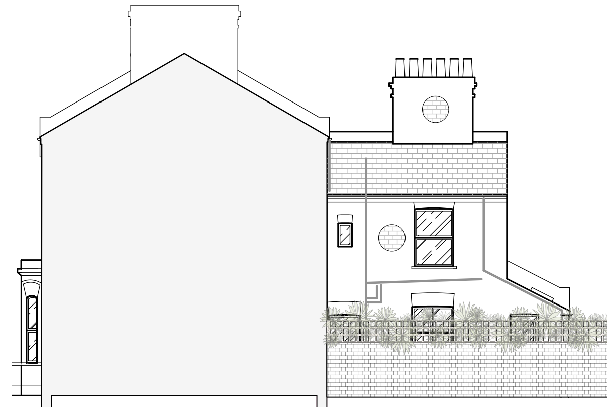
ELEVATION - EXISTING SIDE ELEVATION SCALE: 1:100 @ A3

NOTE: EXISTING ELEVATION SHOWN ALONG SIDE PROPOSED FOR COMPARISON