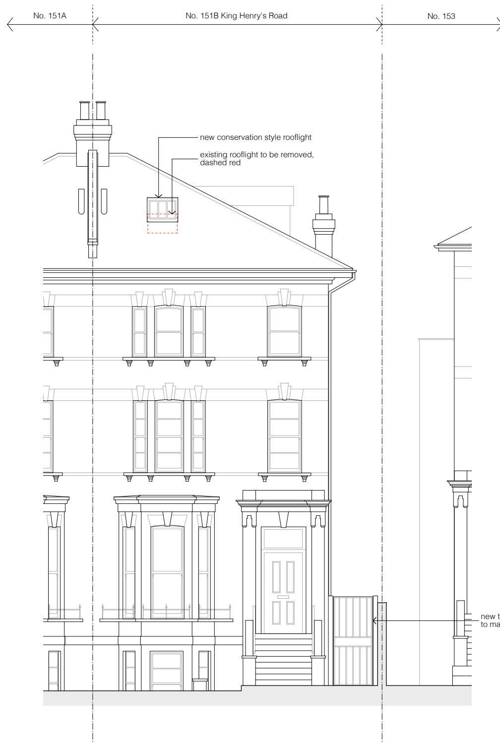
FRONT ELEVATION: PROPOSED