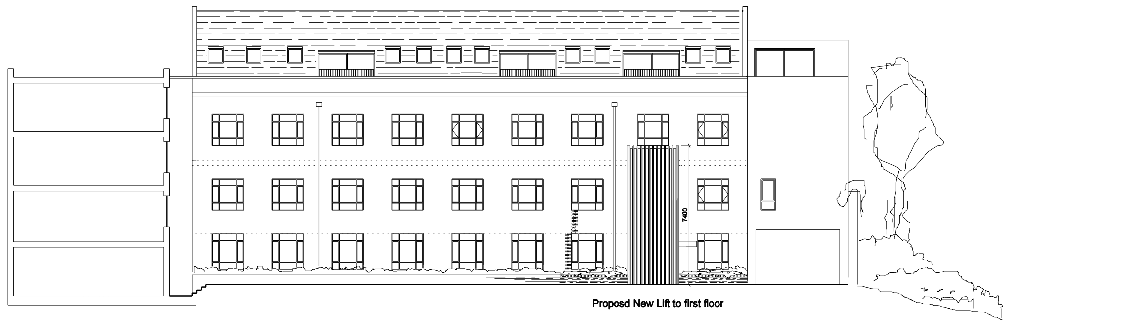
Proposed Long Elevation / section through courtyard

/ 31/03/17 For Planning rev date amendment project 73 Maygrove Road scale 1:200 @ A3 drawing Proposed and Existing Ele / Section thru. Courtyard drawing no PL - 201