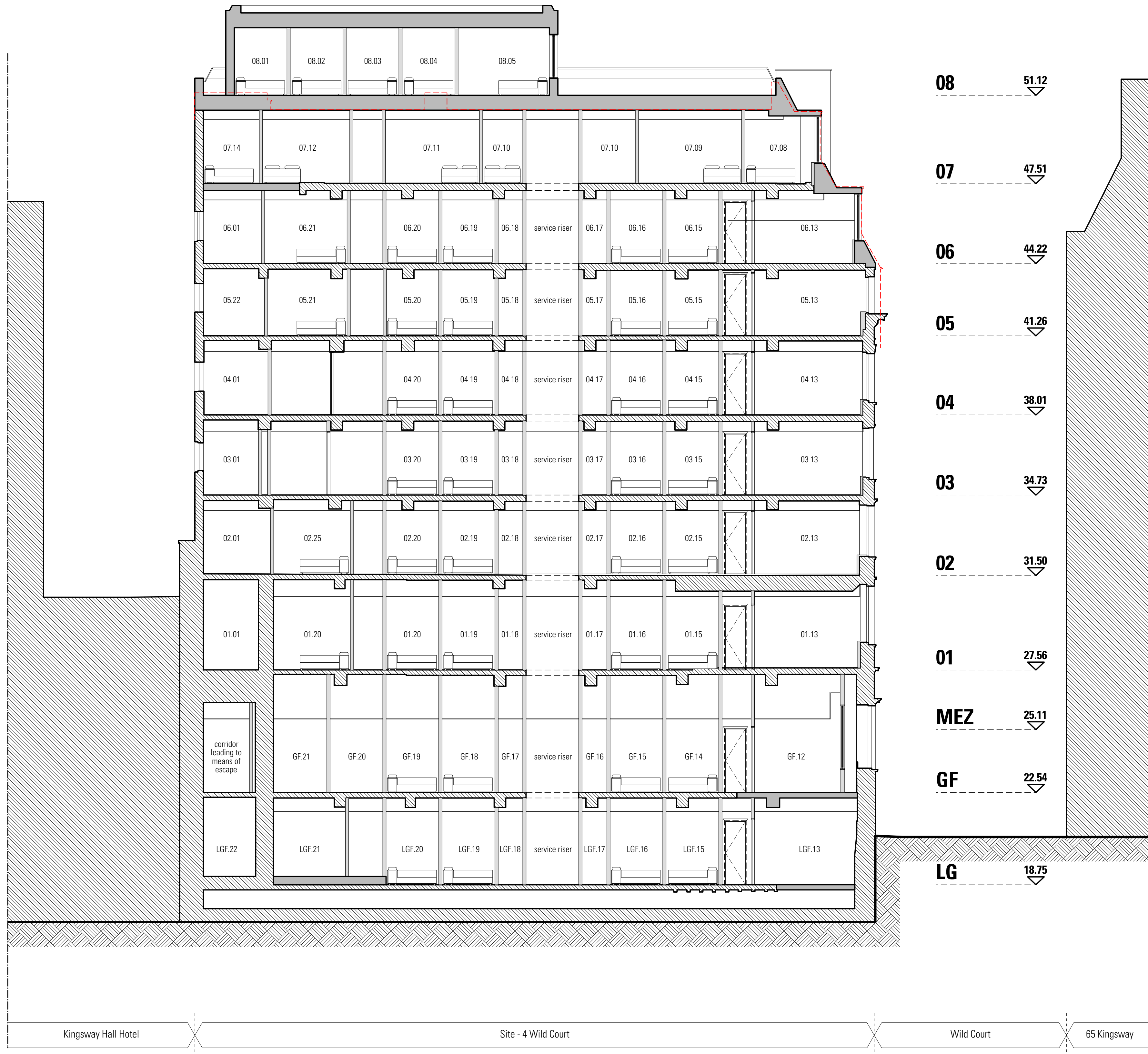
01 Proposed Section CC' Scale 1:100 @ A1 / 1:200 @ A3