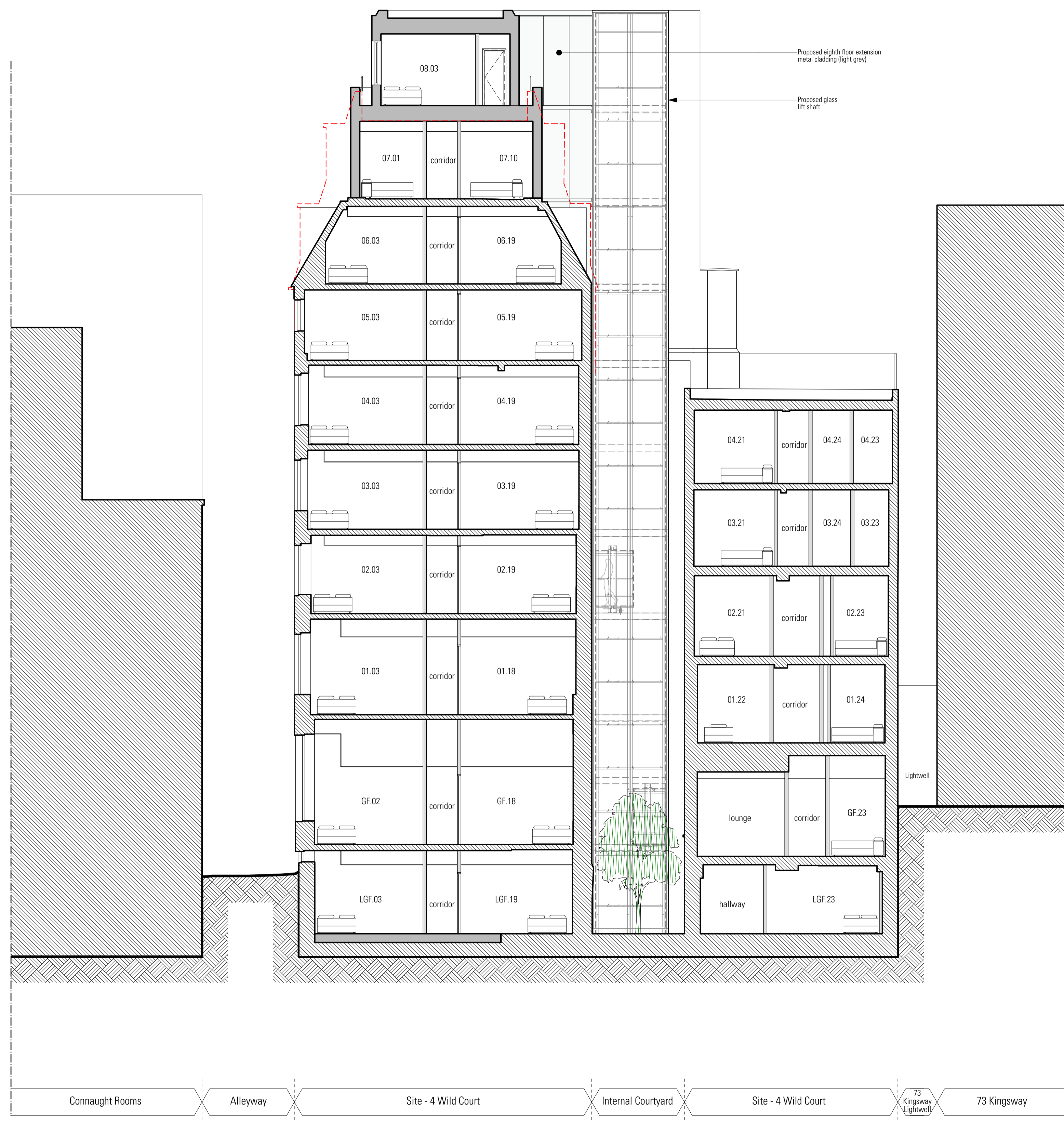
01 Proposed Section BB' Scale 1:100 @ A1 / 1:200 @ A3