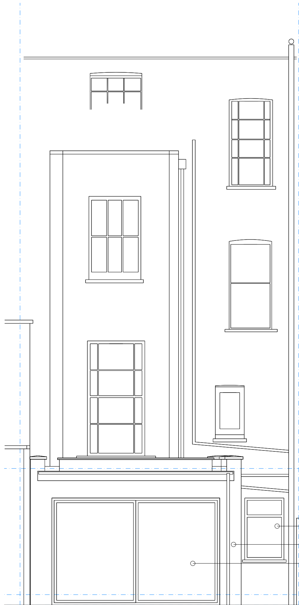
01 PROPOSED REAR ELEVATION A20E00 SCALE: 1:50