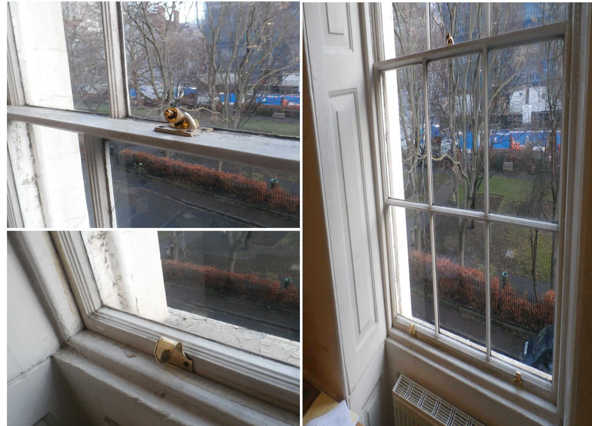
Existing Window Ironmongery