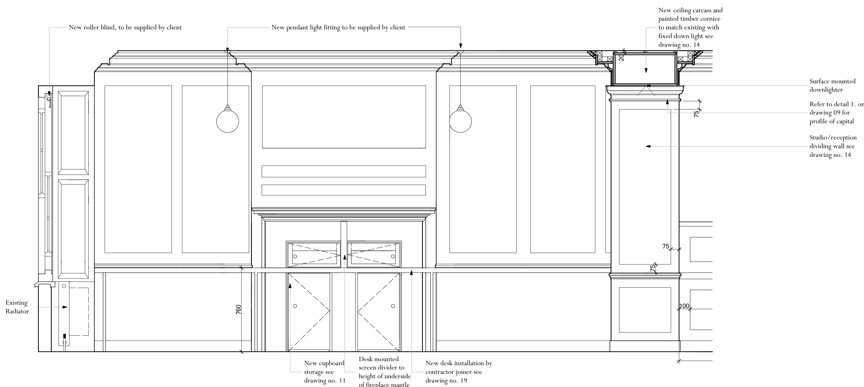
Proposed South Wall - Reception & Studio