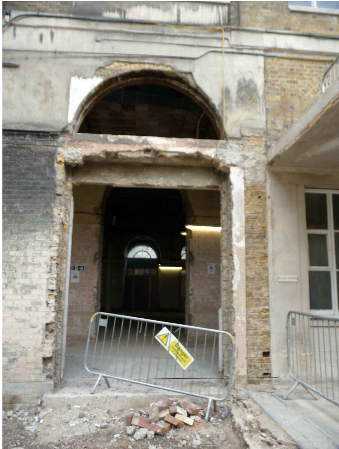
Existing DE/03 Opening - Image 01 NTS @ A1