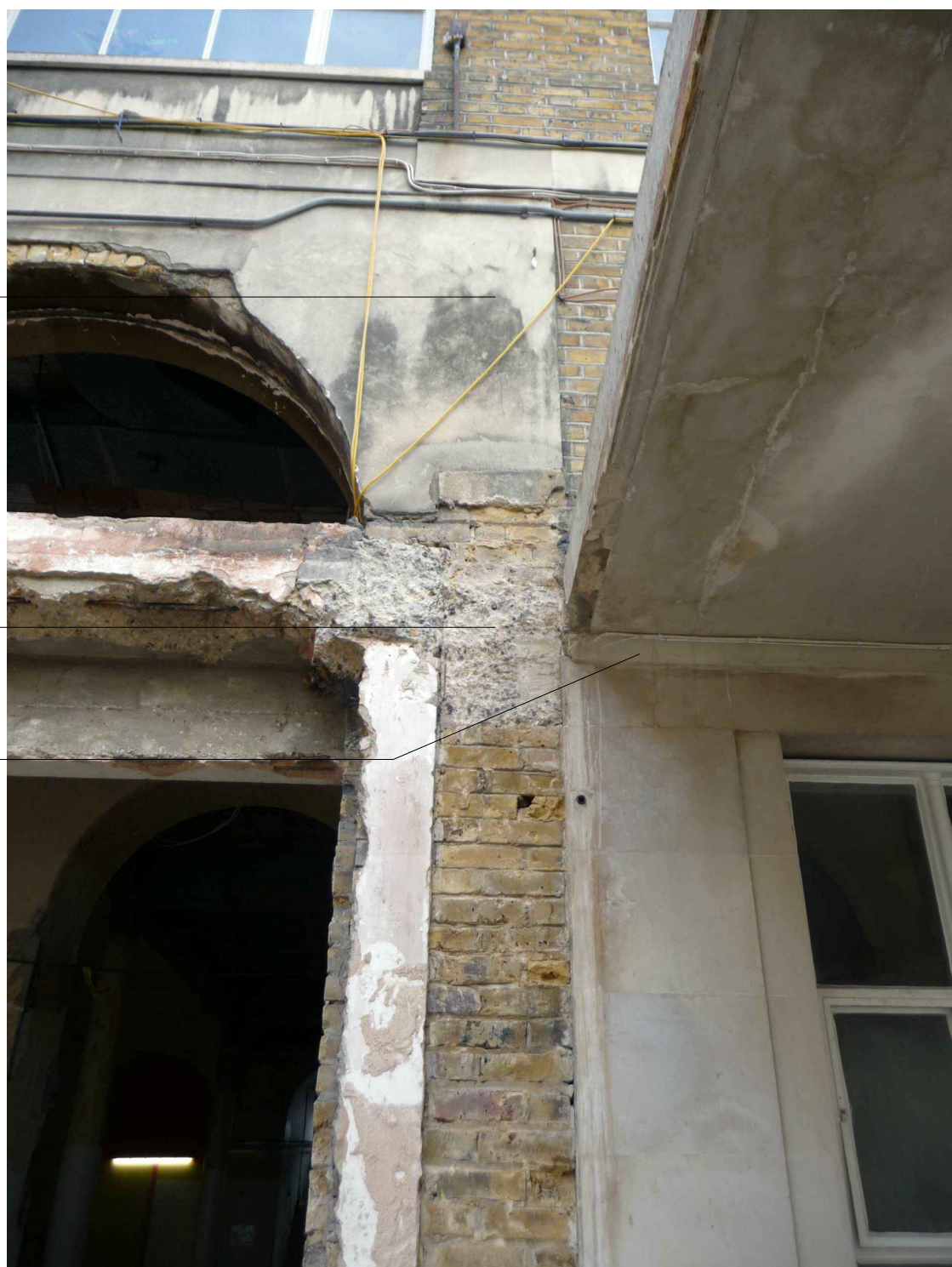
Existing DE/03 Opening - Image 02 NTS @ A1