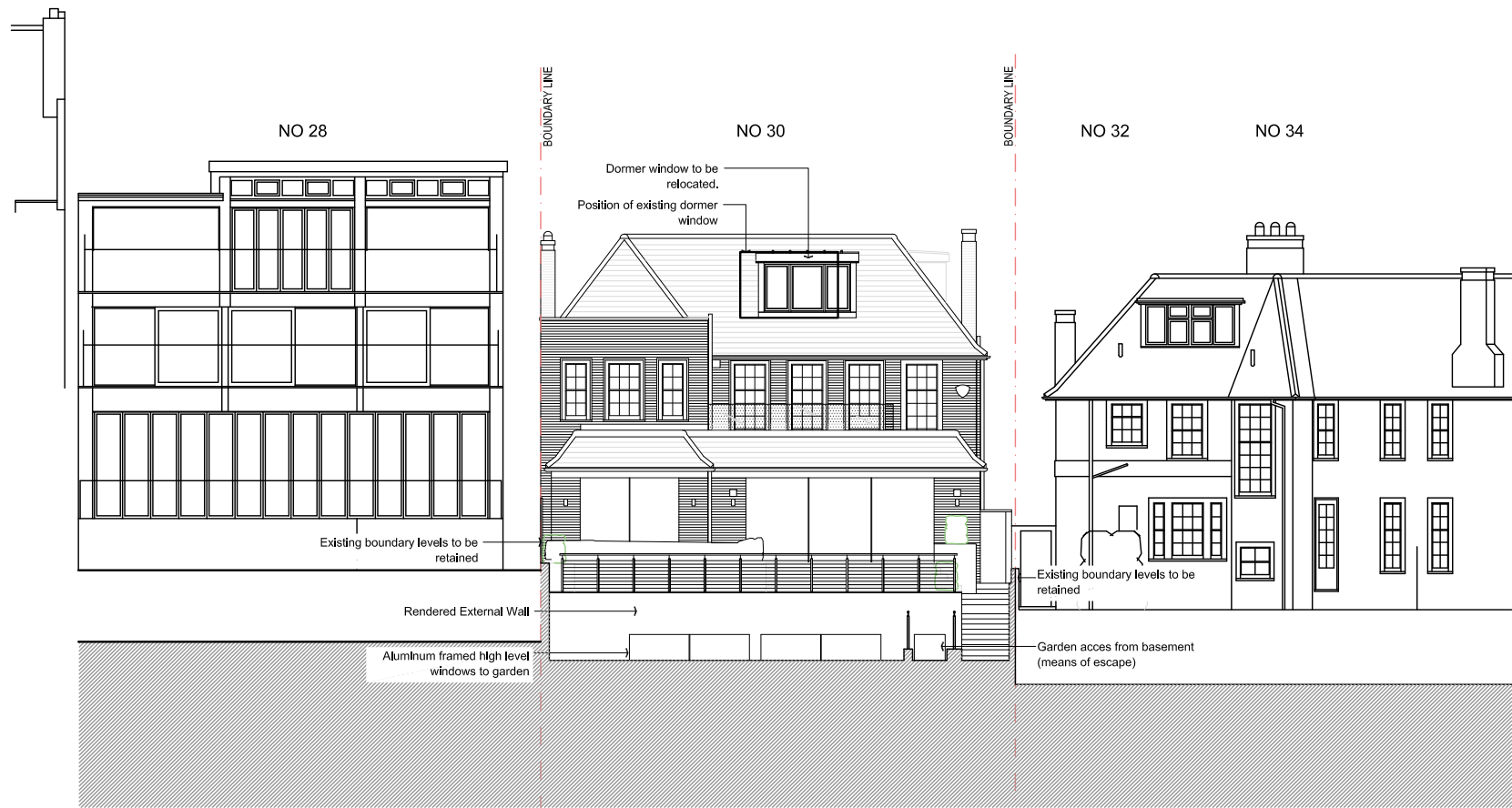
02 Proposed Rear Elevation Scale 1 : 100 @ A1 / 1 : 200 @ A3