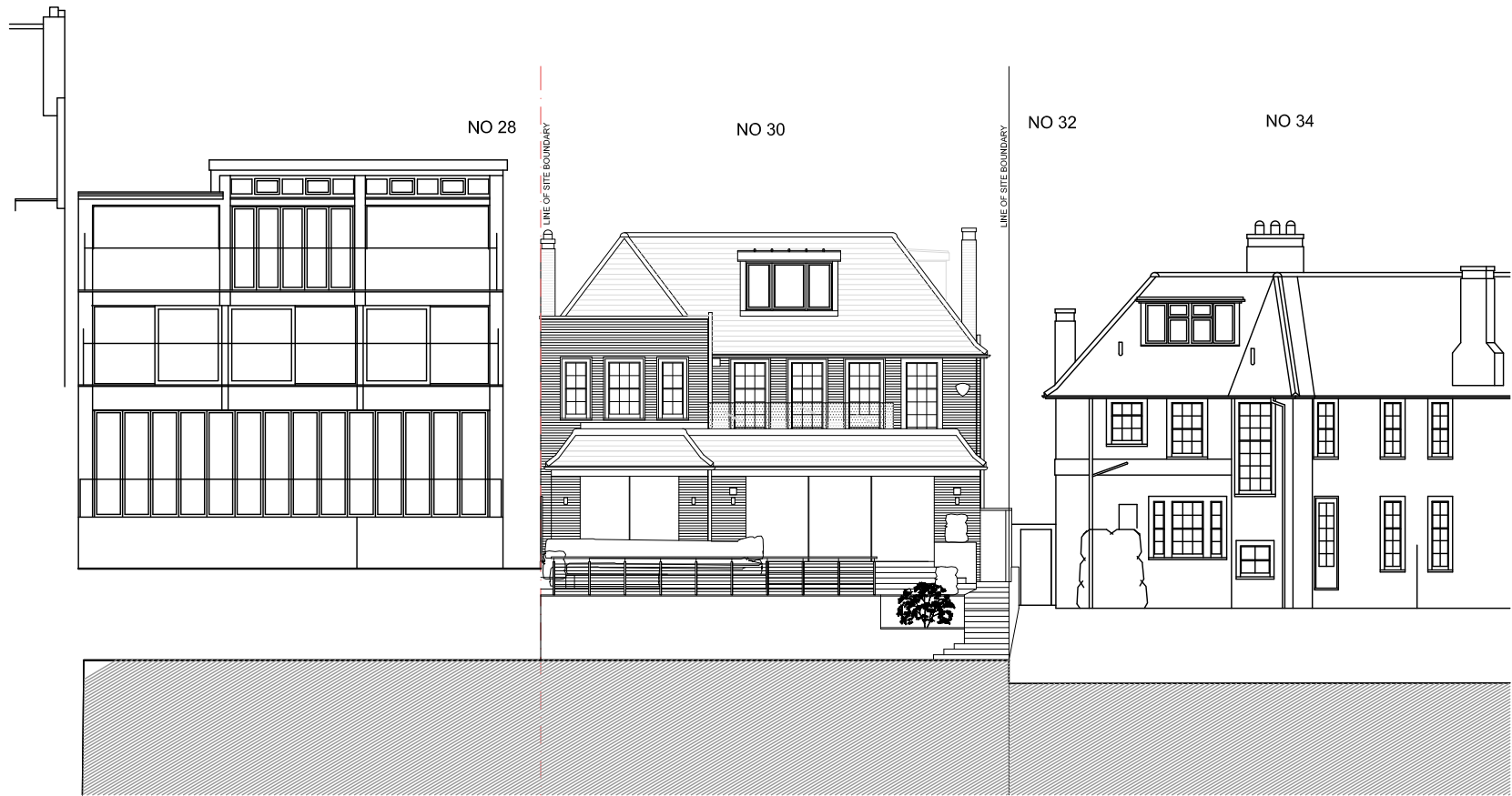
01 Existing Rear Elevation Scale 1 : 100 @ A1 / 1 : 200 @ A3