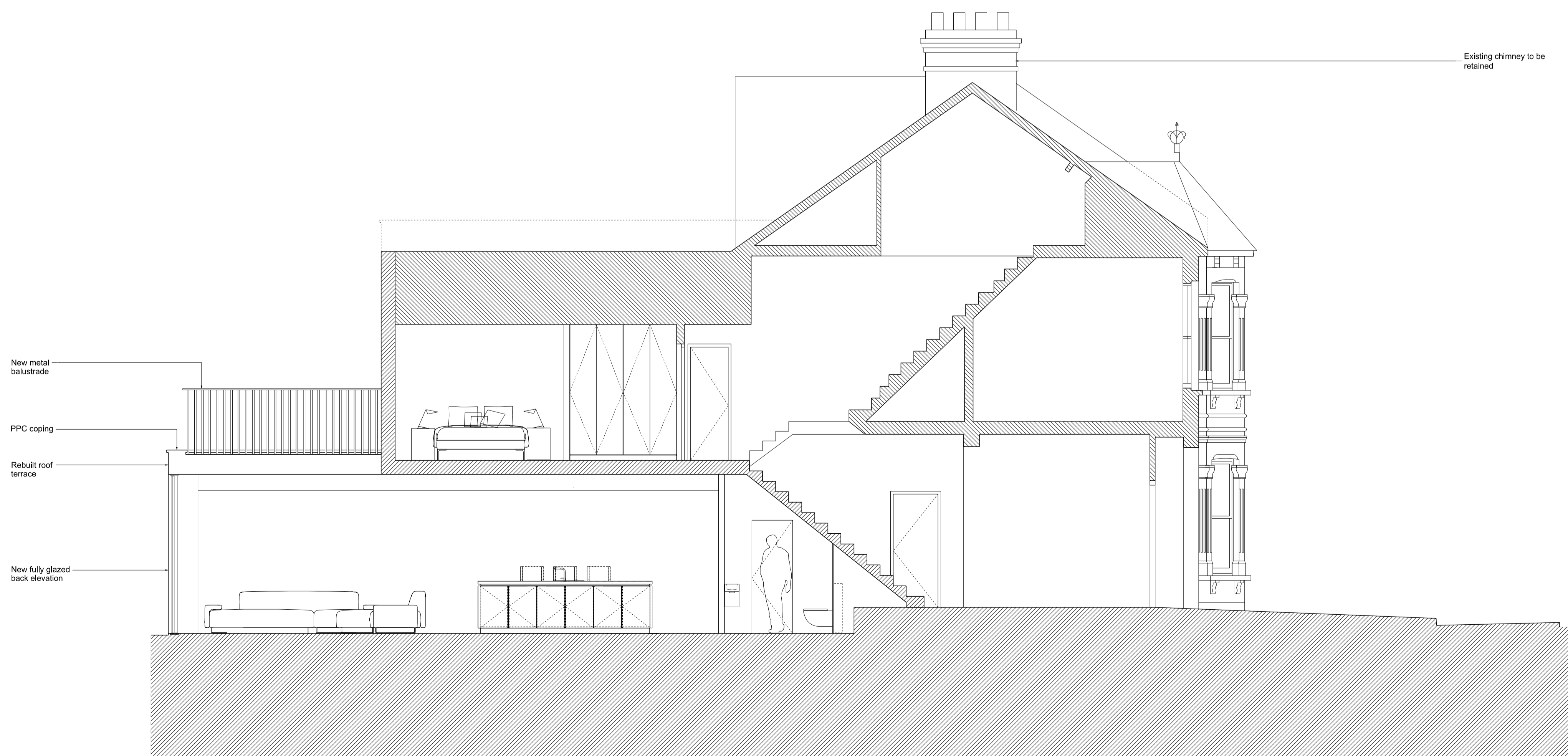
PROPOSED SECTION A