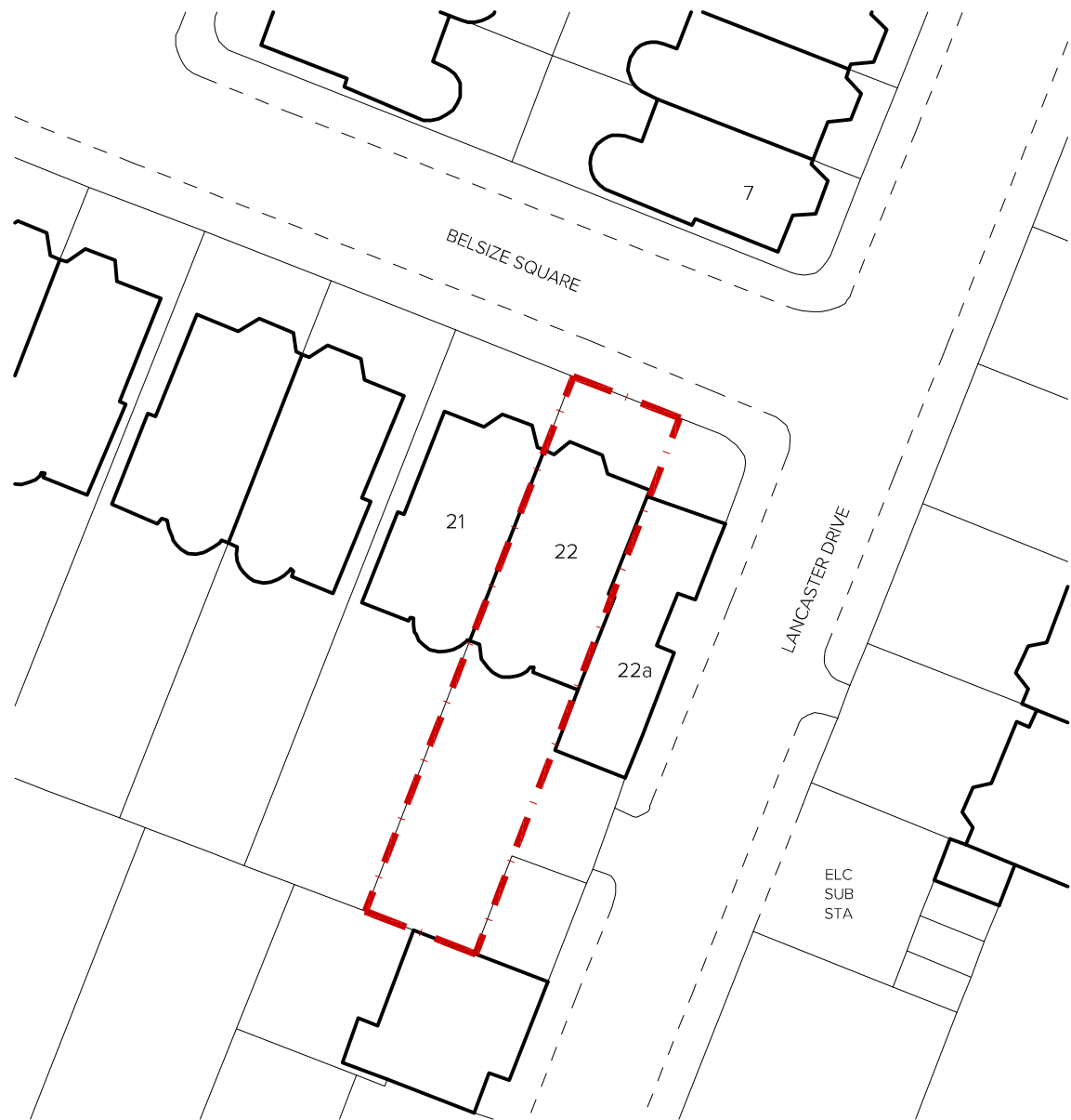
SITE PLAN 1:500 @ A3