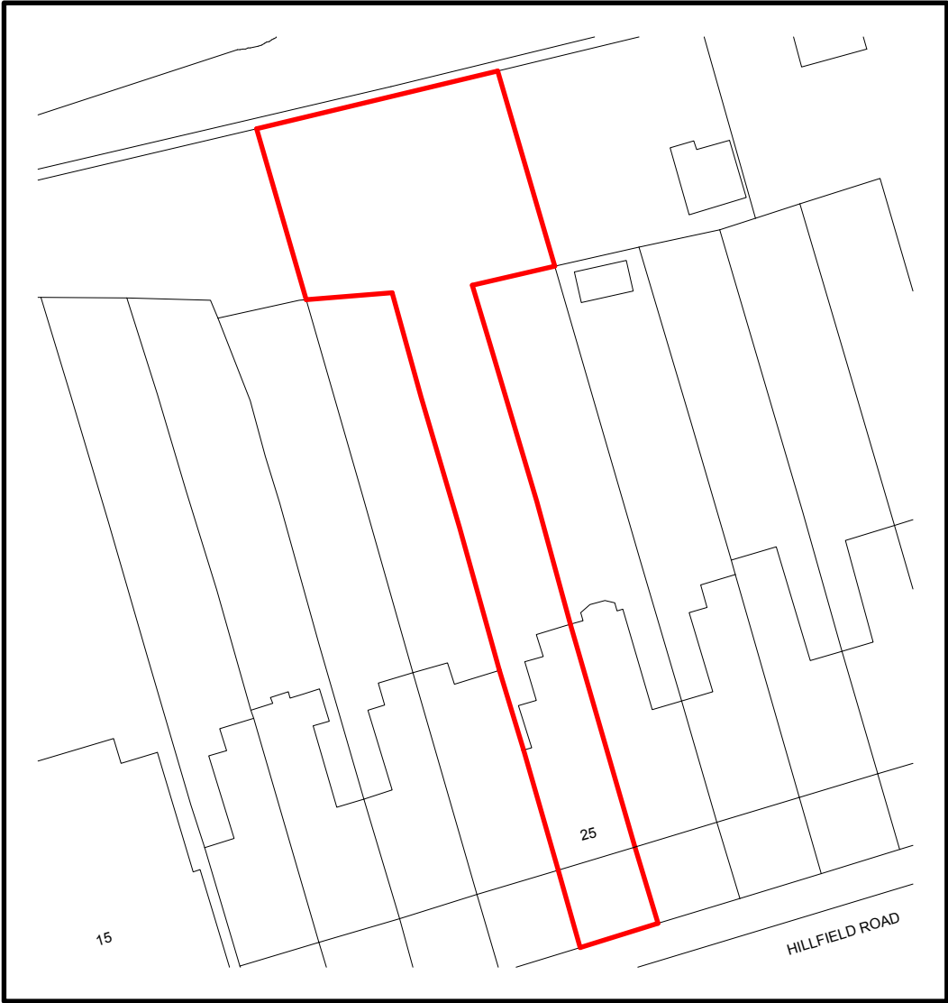
BLOCK PLAN @ 1:500