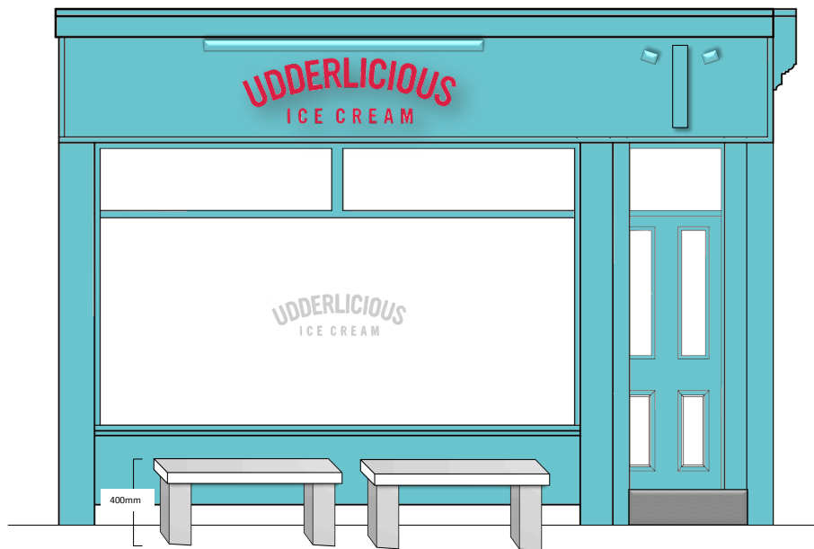
PROPOSED ELEVATION, 1:25