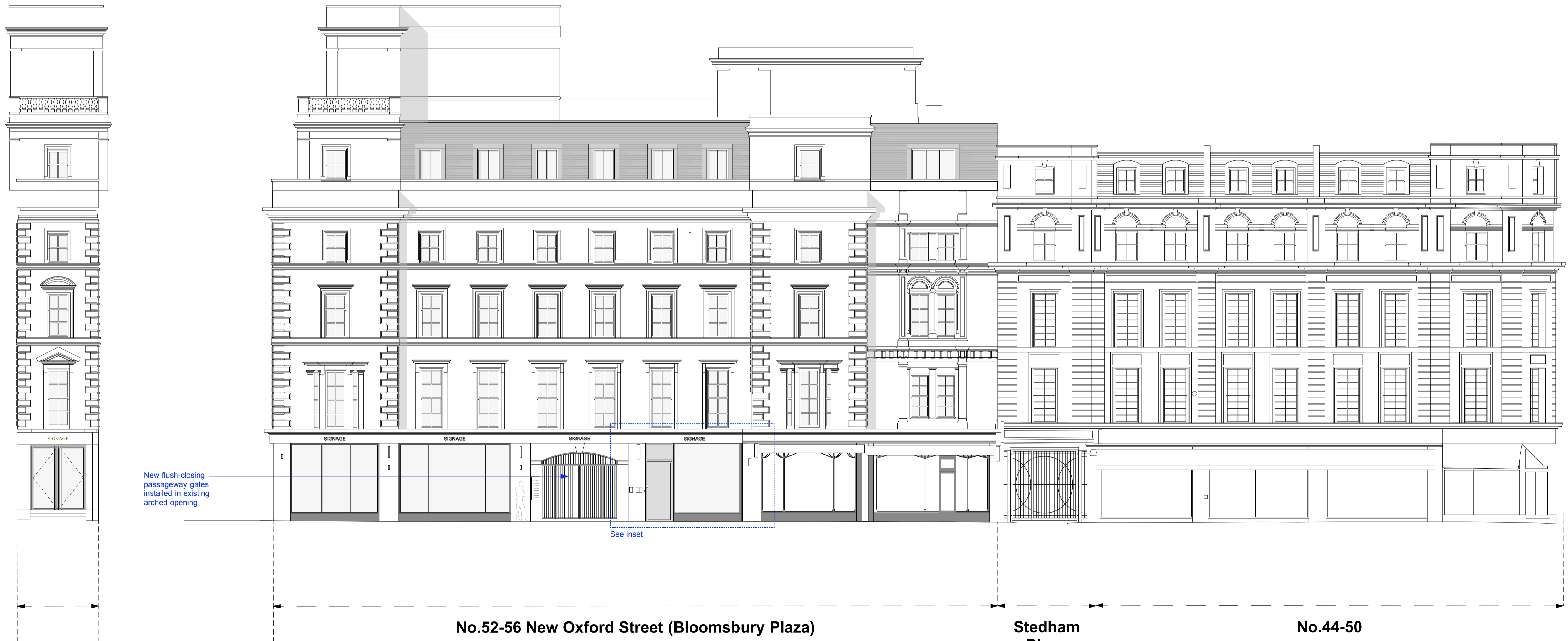
1 Proposed New Oxford Street Elevation 1:100 at A1

DRAWING NOTES: All dimensions to be checked on site prior to commencement of any works, and/or preparation of any shop drawings. Sizes of and dimensions to any structural elements are indicative only. See structural engineers drawings for actual sizes/dimensions. Sizes of and dimensions to any service elements are indicative only. See service engineers drawings for actual sizes and dimensions. This drawing to be read in conjunction with all other Architect's drawings, specifications and other Consultants' information. All proprietary systems shown on this drawing are to be installed strictly in accordance with the Manufacturers/Suppliers recommended details. Any discrepancies between information shown on this drawing and any other contract information or manufacturers/suppliers recommendations is to be brought to the attention of the Architect. DO NOT SCALE FROM THIS DRAWING.