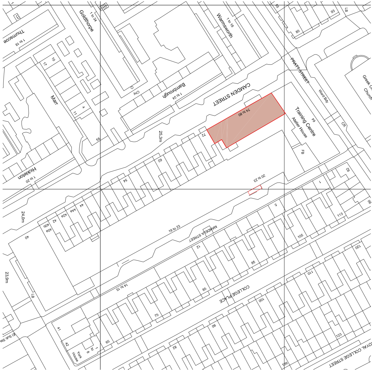
2 SITE PLAN Scale 1:1250@A1

This drawing is protected under Copyright and at no time must any portion of this drawing be reproduced or copied in anyway without the permission of Morgan Lovell. All dimensions must be checked on site and NOT scaled from this drawing.