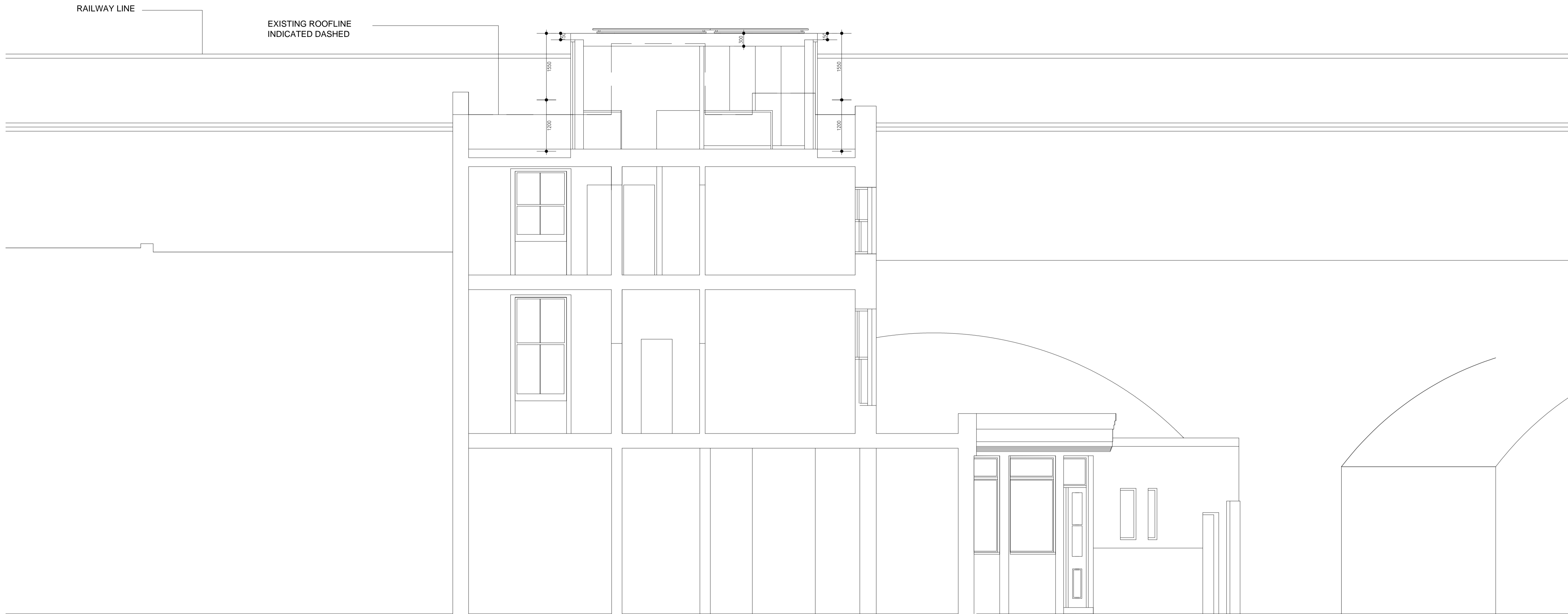
PROPOSED CROSS SECTION B - B