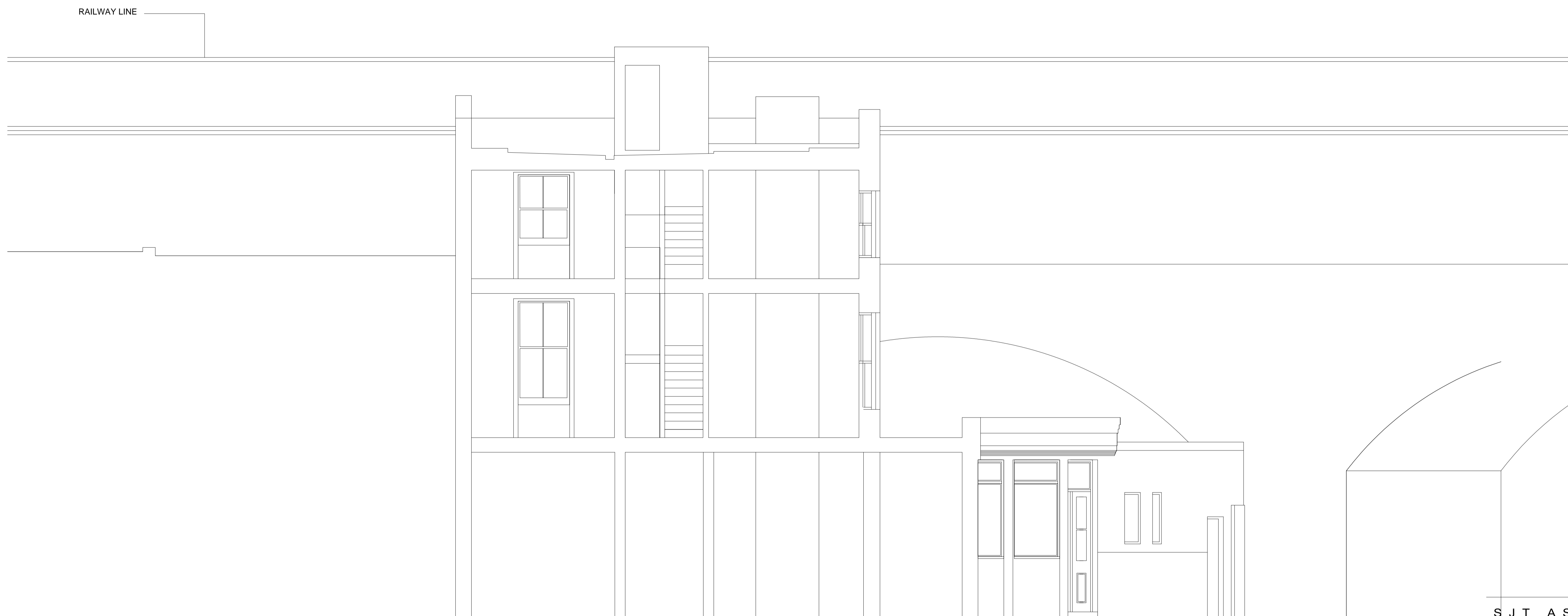
EXISTING CROSS SECTION B - B