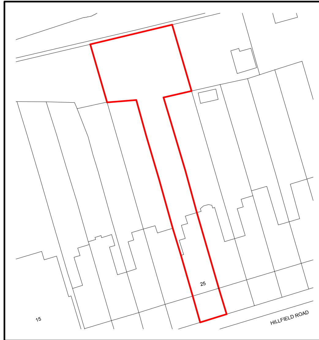
BLOCK PLAN @ 1:500