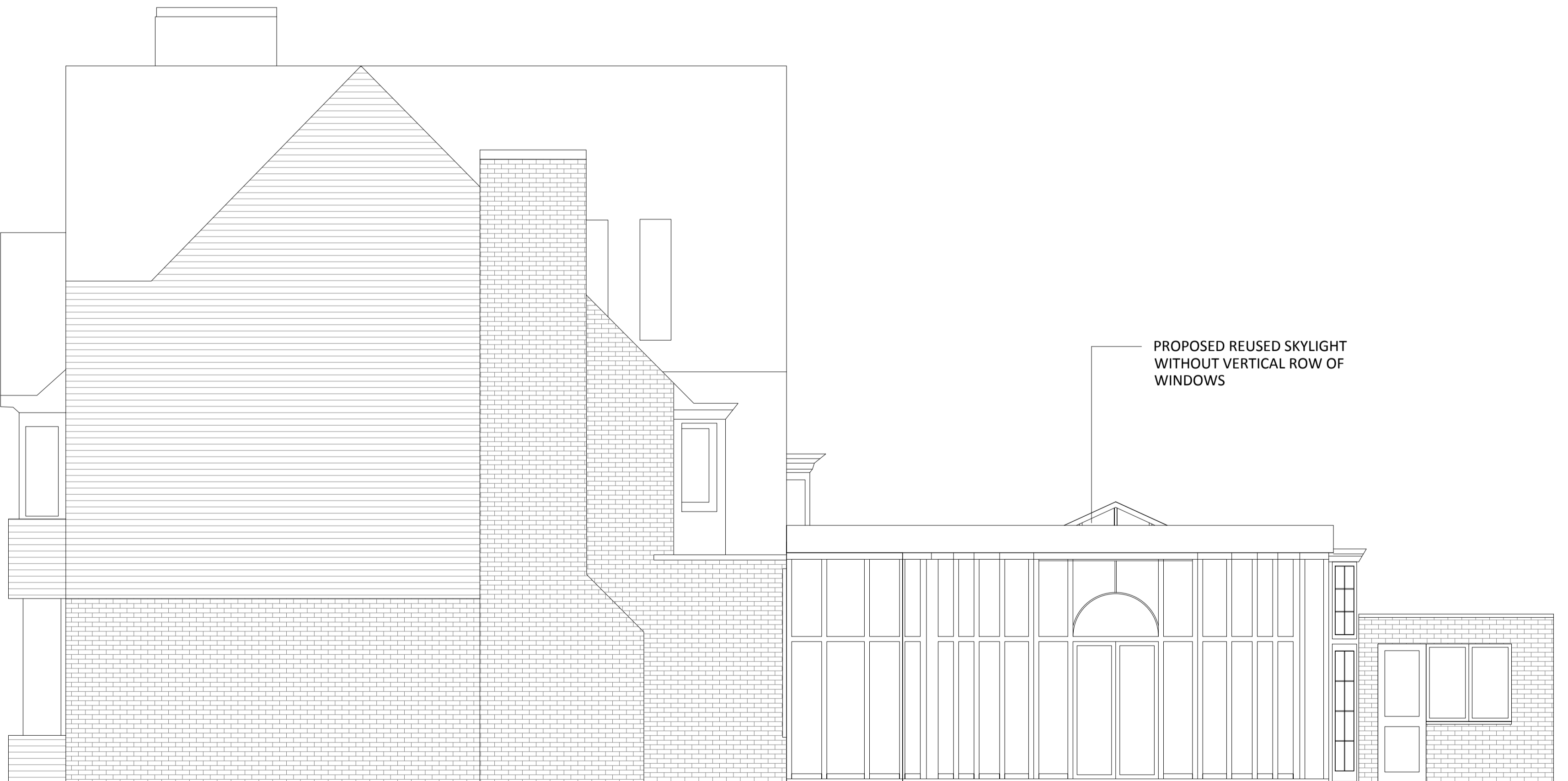
01 PROPOSED REAR (NORTH) ELEVATION SCALE 1:50

PROPOSED REUSED SKYLIGHT WITHOUT VERTICAL ROW OF WINDOWS