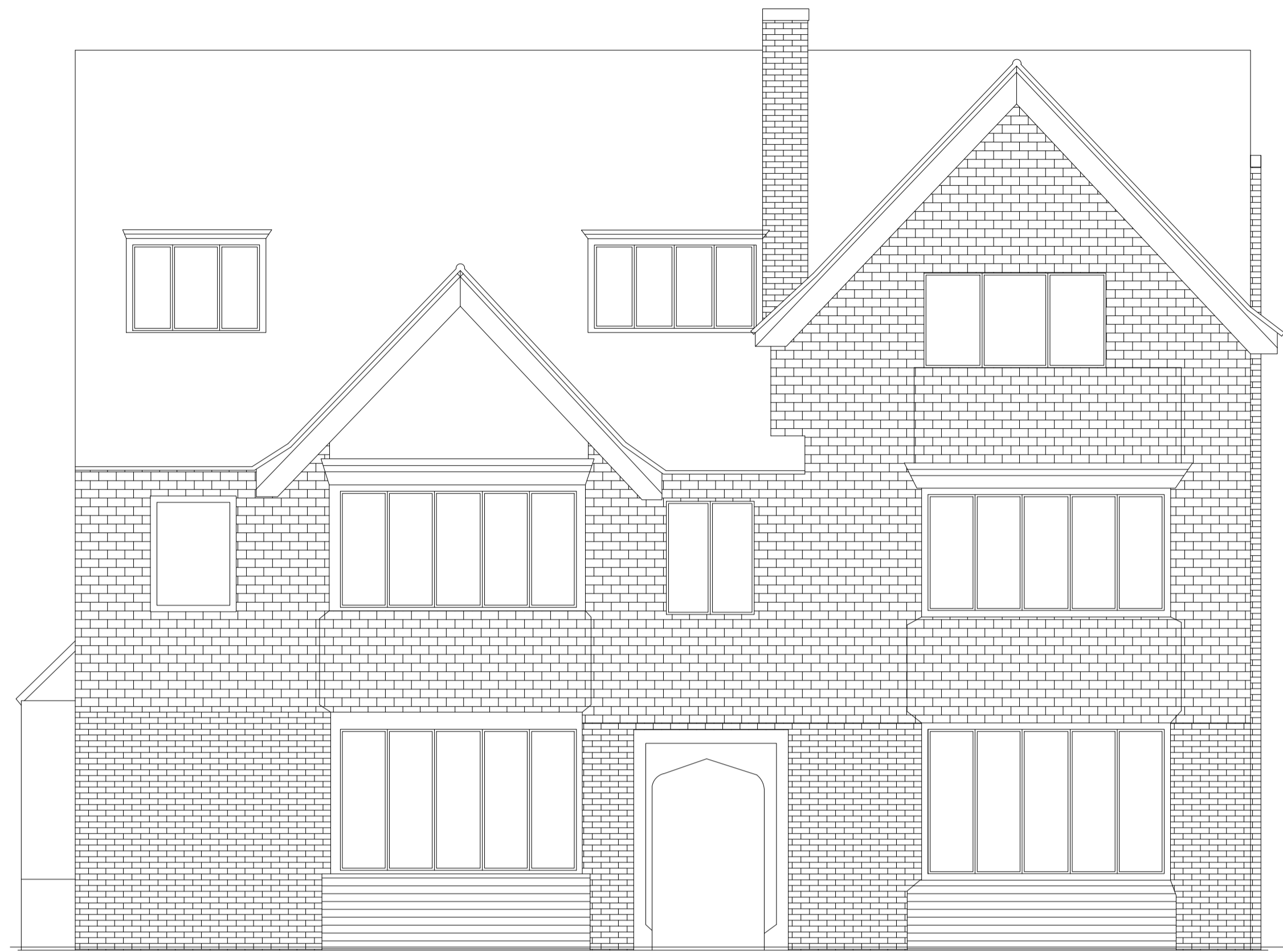
01 EXISTING FRONT (SOUTH) ELEVATION 9WG-ID-(12)-01 SCALE 1:50