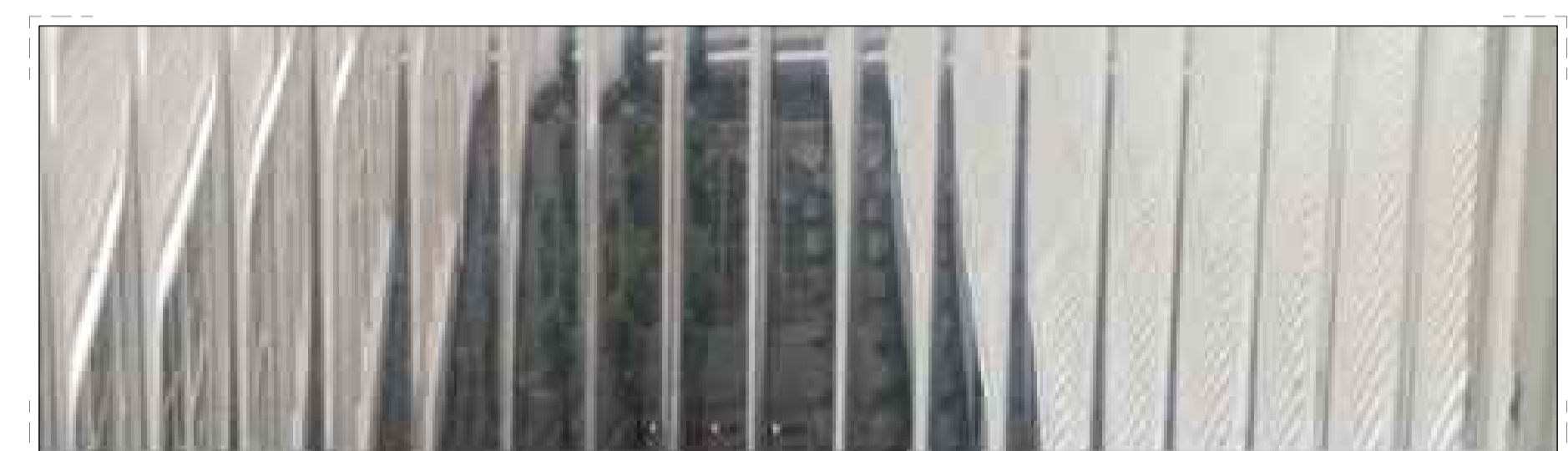
03 Pilkington Textured Glass - New Reeded