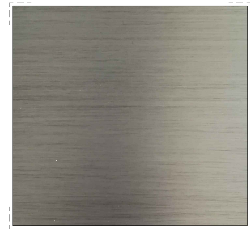
02 Gunmetal Door Frame