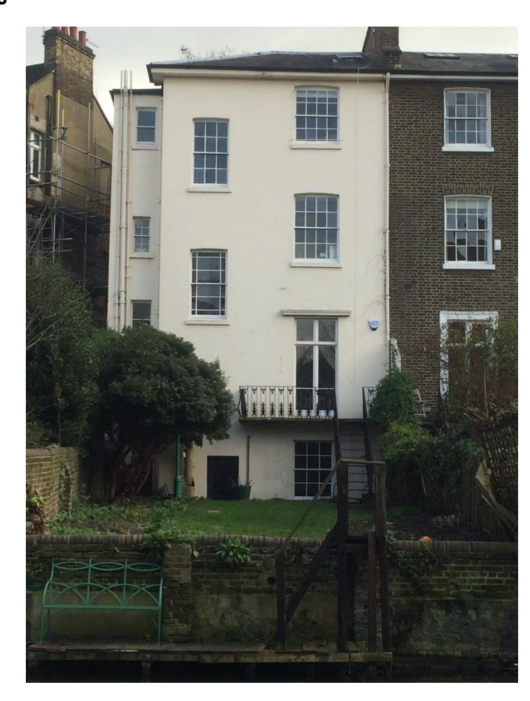
Right: View of rear elevation from opposite side of Regents Canal