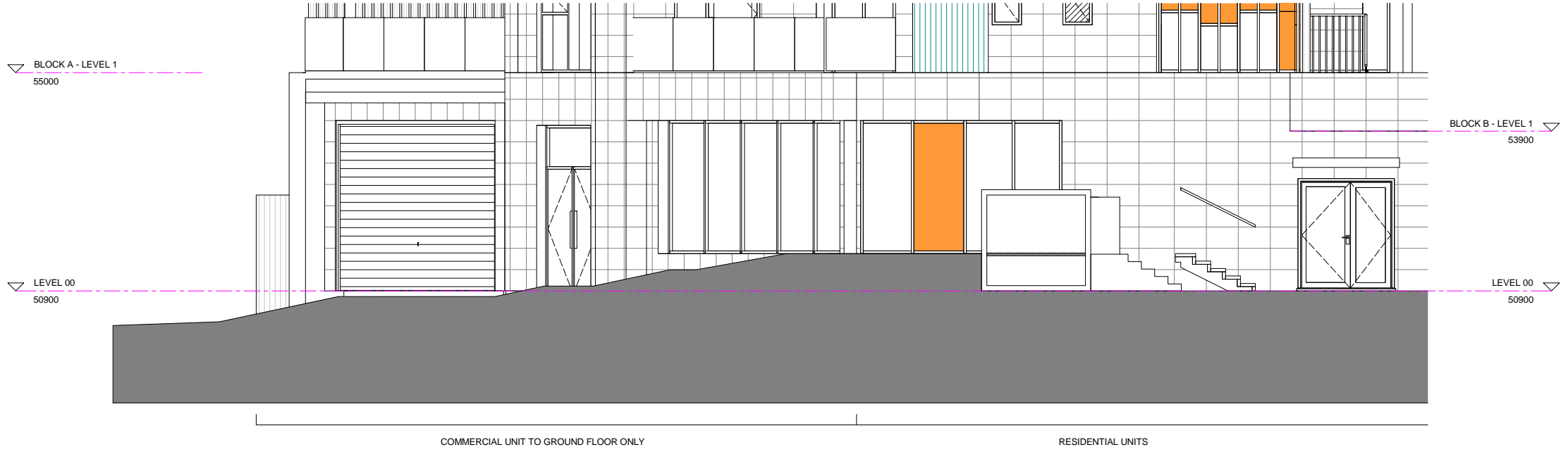
2 GA - EAST ELEVATION - COMMERCIAL UNIT 1 : 50