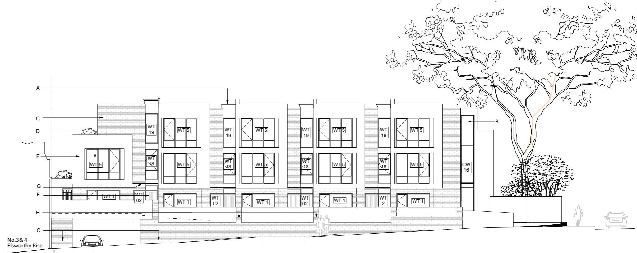
EAST ELEVATION (FRONT) ELSWORTHY RISE 1 : 200