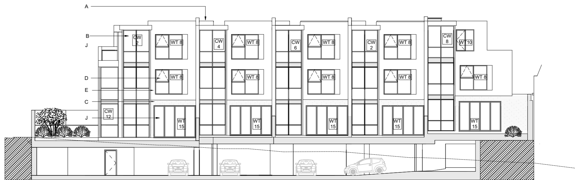
WEST ELEVATION (BACK) PRIVATE GARDENS 1 : 200