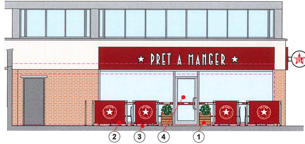
Proposed External Elevation - Herbrand Street