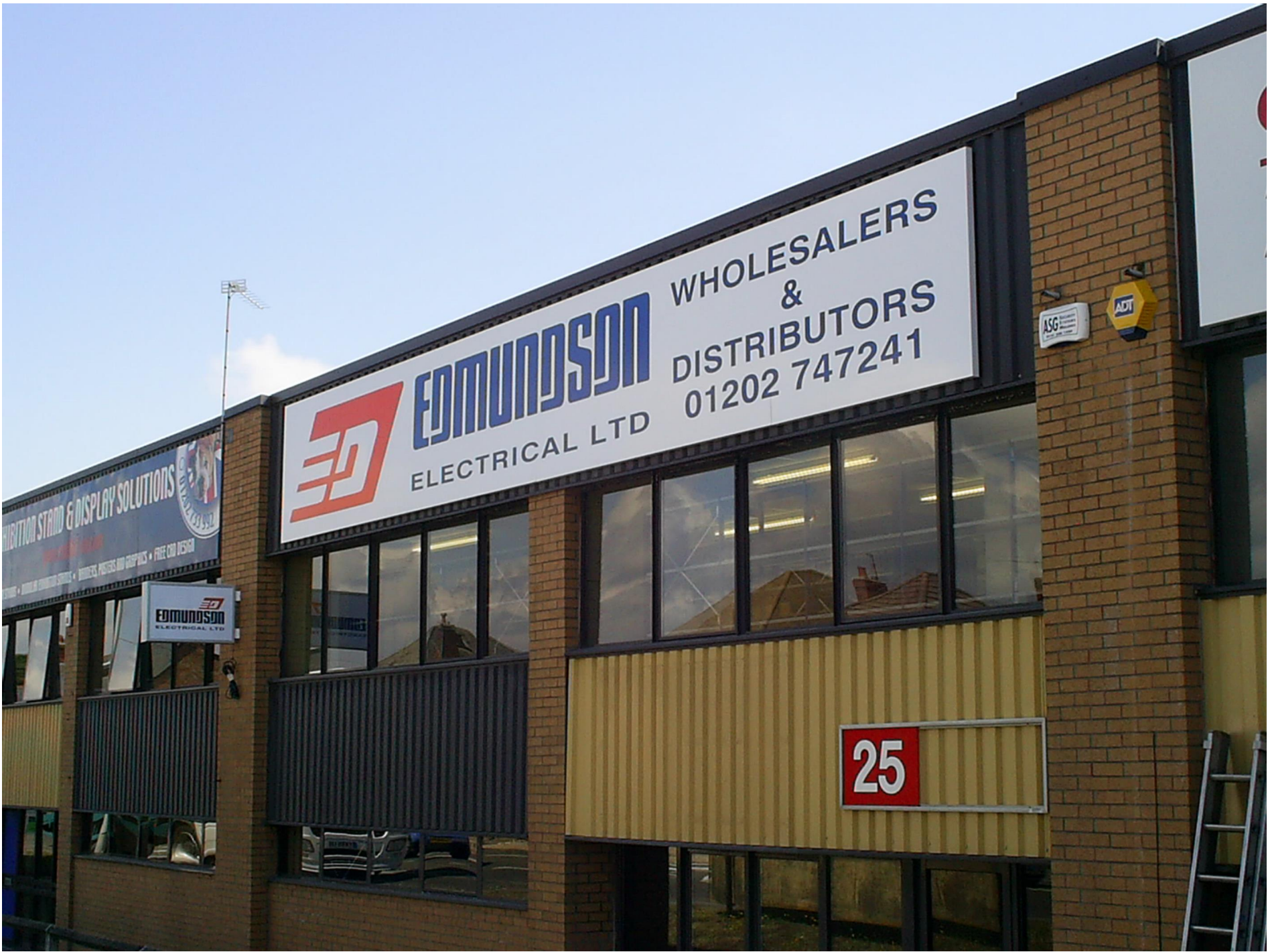
③ Example of Di-bond fascia advertisement NTS