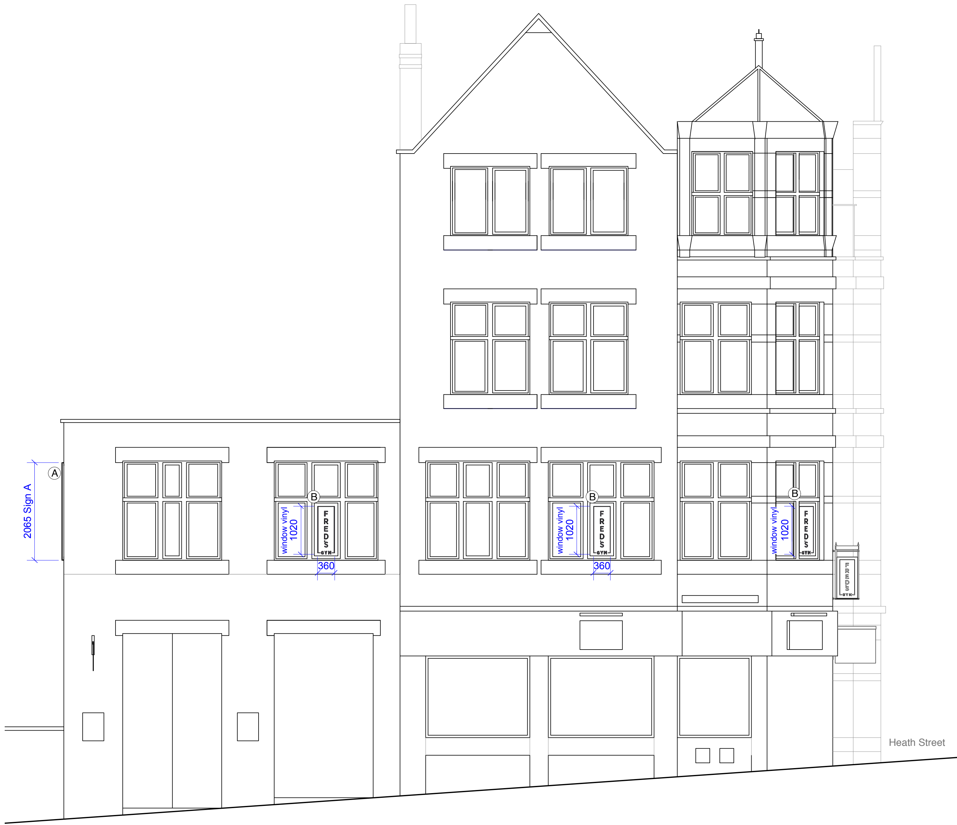
① Proposed Elevation 1 - Oriel Place 1:100 @ A3