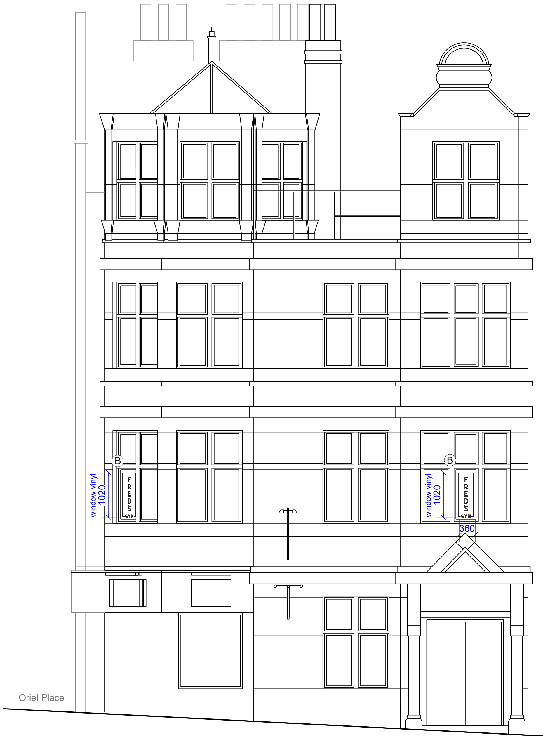
② Proposed Elevation 2 1:100 @ A3