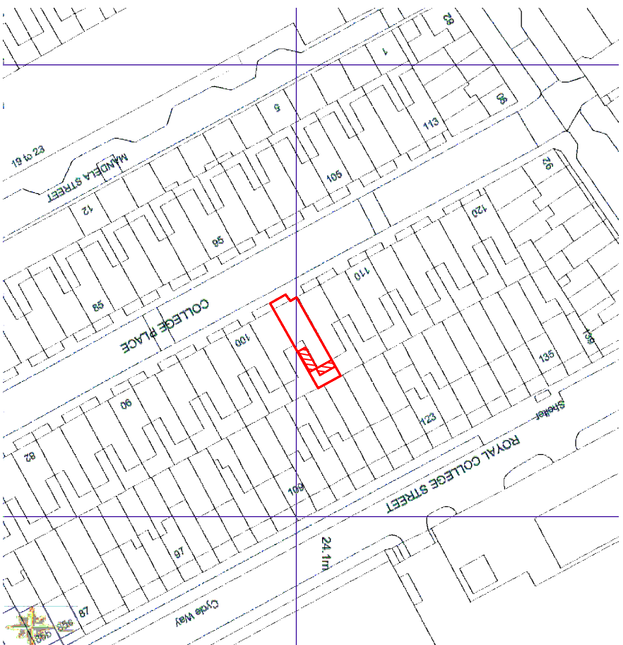
SITE LOCATION PLAN 1:250