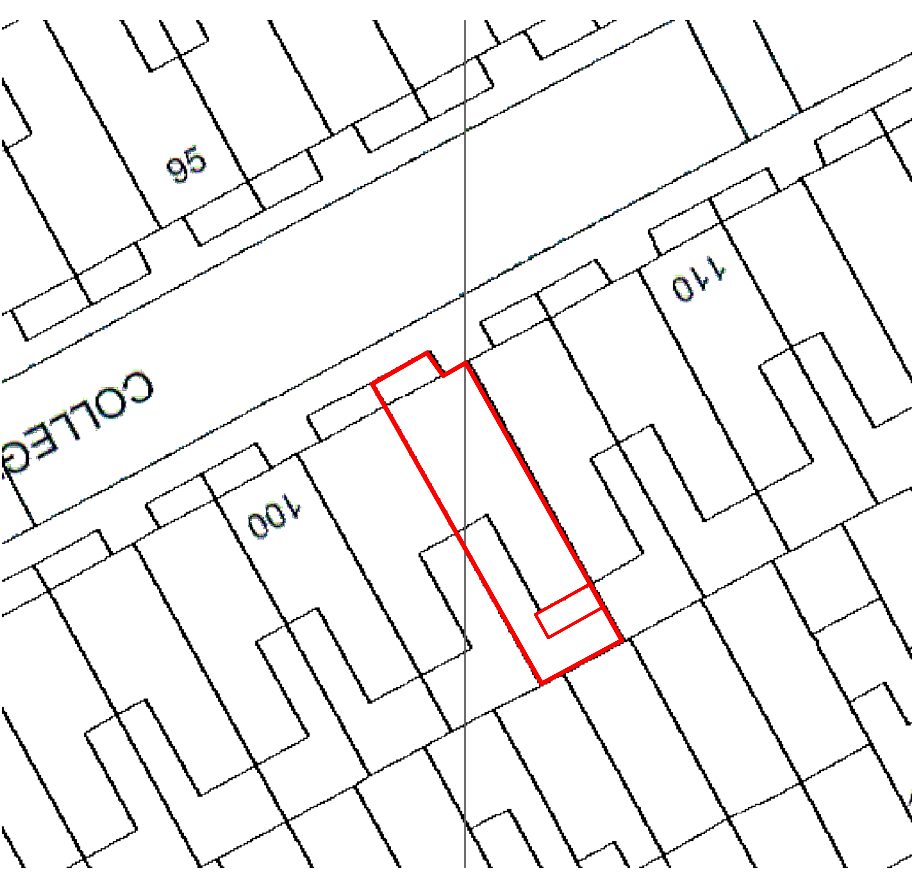
BLOCK LOCATION PLAN 1:500