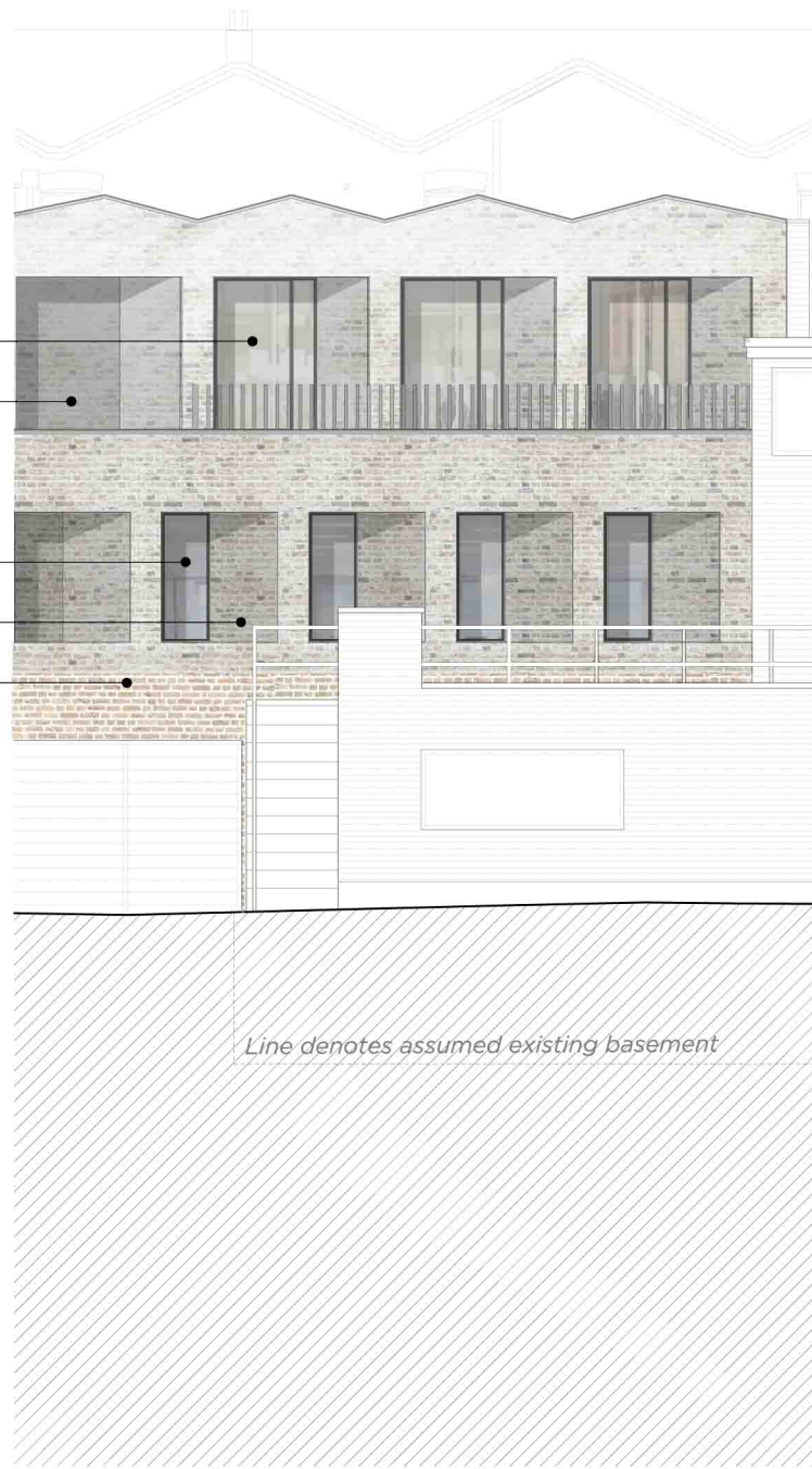
P_40 04 South West Elevation 1:50