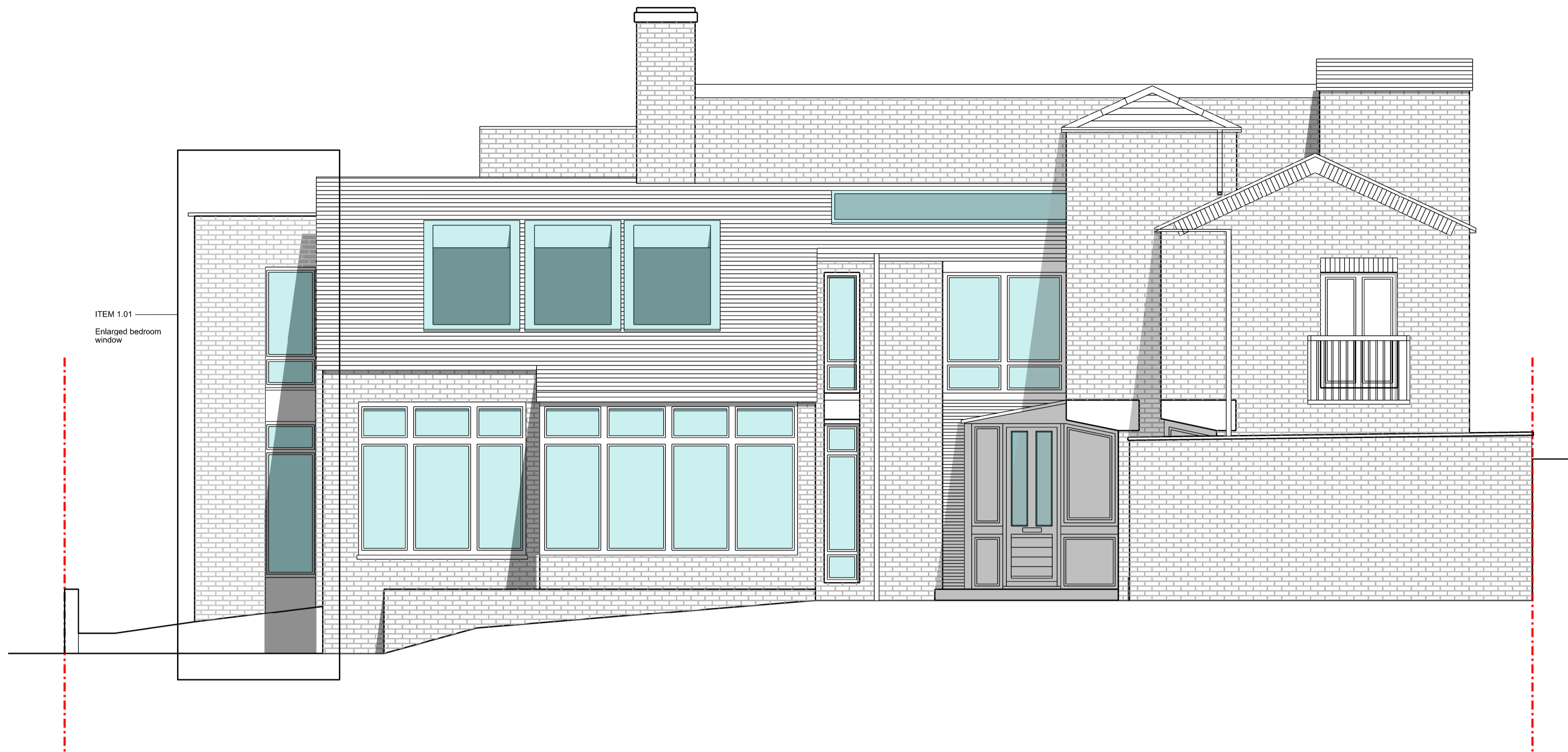
01 FRONT (SOUTH) ELEVATION AS PROPOSED KAM02_P_131 SCALE 1:50 @ A1

General Notes: Should any discrepancies be noted, please inform the Architect