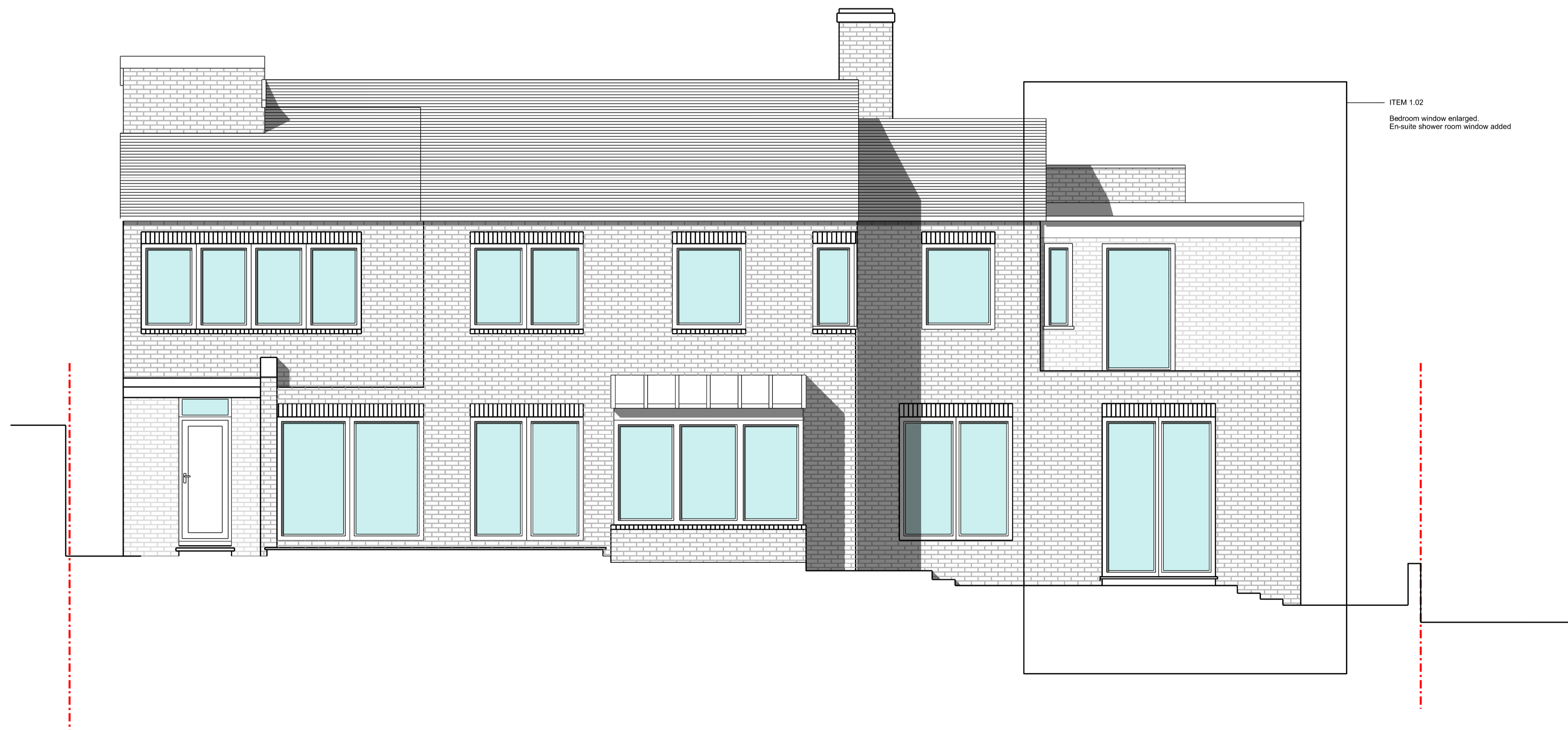
02 REAR (NORTH) ELEVATION AS PROPOSED KAM02_P_131 SCALE 1:50 @ A1

P02 Flat floor extension removed. Issued for Planning 15.03.17 TB VP P01 Issued for Planning 02.07.15 TB VP Rev: Description: Date Dwn by: Ckd by: