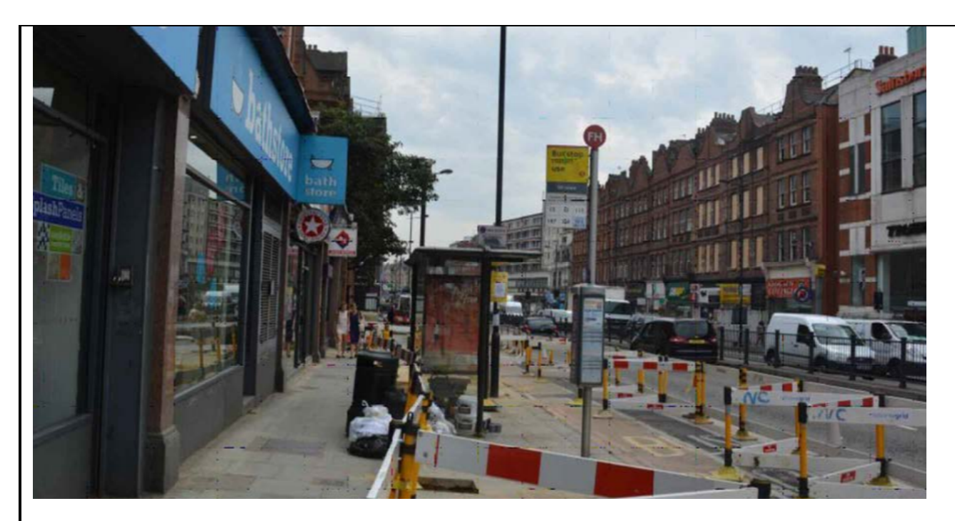
Figure 1 – facing south-east towards Swiss Cottage